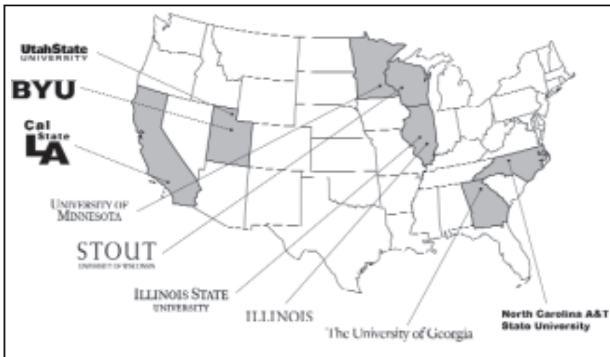
Figure 1: NCETE Partners

development could be applied to many levels. We have chosen to focus on Grades 9 to 12 during the first five years.