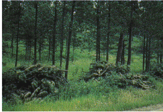
Figure 7. Pine slash susceptible to Ips pini infestation.

Most pine engraver problems are associated with disturbances such as windthrow and snow breakage, drought in spring and early summer, logging, fires, road construction, housing development or other human activities. Pine slash or weakened trees created by these disturbances attract beetles and provide ideal conditions for population buildup and subsequent tree killing (figure 7).