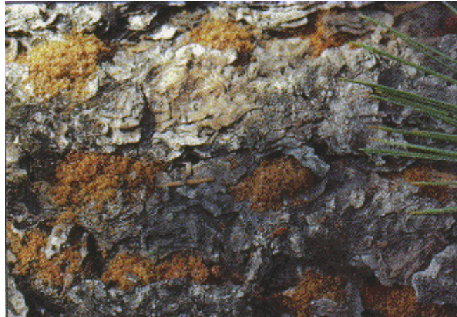
Figure 3. Pine engraver boring dust marking the entry points of beetles.