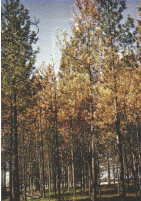
Figure 2. Ponderosa pines killed and top-killed by the pine engraver.