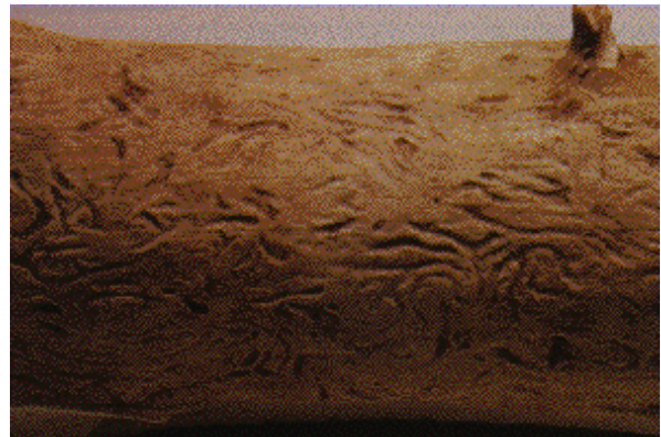
Figure 6. Mazelike galleries of Ips pini produced during feeding attacks in late summer.

A female lays from 30 to 60 eggs along the sides of the egg gallery, which usually ranges from 4 to 7 inches long. Eggs hatch within 4 to 14 days, and larvae mine laterally from the egg gallery for 1 to 2 inches. Larval mines, unlike the parent tunnels, are packed with shredded phloem and excrement collectively called "frass." Larvae feed for 2-4 weeks and