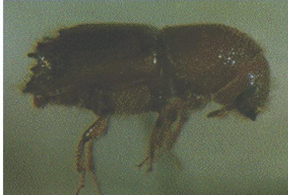
Figure 4. Adult male pine engraver (a "callow" adult). Note prominent posterior declivity and spines