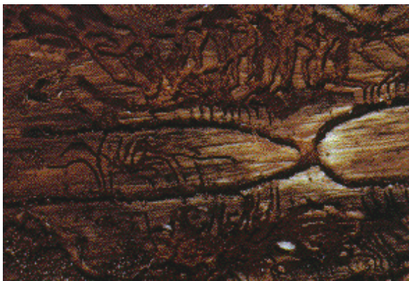
Figure 5. Egg and larval galleries of Ips pini in ponderosa pine.

Attacks are initiated by male beetles that bore through the outer bark into bark (phloem) and excavate a nuptial chamber several times the beetle's size. Pheromone attractants released by the male attract one to seven females, though typically two or three. After mating, each female constructs a tunnel or "egg gallery" in the phloem layer, slightly scoring the wood surface in the process. These galleries radiate from the nuptial chamber and frequently form a Y- or H-pattern aligned with the grain of the wood (figure 5). During gallery construction, the boring dust is pushed to the outside, clearing the nuptial chamber and egg galleries. Additional males are also attracted to the vicinity of the initial attack. The attractant pheromone promotes an aggregation of beetles or "mass attack."