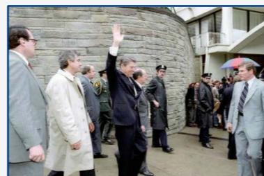
President Reagan, flanked by SAC Jerry Parr, waves moments before being shot by Hinckley.

Kennedy. The assassination of John Kennedy in 1963 redefined USSS's identity and norms. Institutionalized paranoia and an emphasis on the counterassassin mindset pervaded USSS after Kennedy's death; training to the point of instinctual reaction and proactive threat neutralization became paramount norms. The post-1963 Secret Service placed high value on agents' ability to liaise effectively with local law enforcement and foreign security apparatuses, adaptability in all protective environments, detail-orientation and perfectionism, and a cerebral approach to protection. Kennedy's death was USSS's darkest hour, and its memory is still agents' deepest motivator.