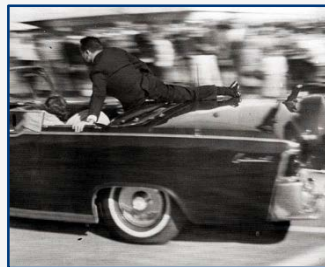
Special Agent Clint Hill rushes to the aid of President Kennedy after shots are fired.

Truman. The attempt on Harry Truman's life in 1950 by Puerto Rican revolutionaries marked the beginning of the Secret Service's culture of perpetual escalation, leading to exponential growth in numbers and the sophistication of its protective measures. The attack catalyzed the creation of the executive security bubble.