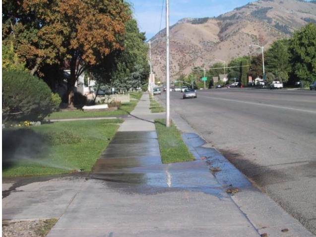
Figure 7. Misaligned sprinklers spraying across sidewalk and into road.

waterways by washing pollutants into the sewer system.