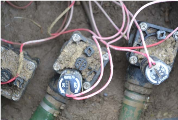
Figure 2. Sprinkler control solenoids and valves.