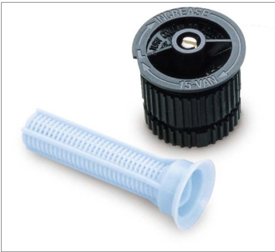
Figure 5. Rainbird filter screen and nozzle.

remove the nozzle and screen. Similar to filters, the screens can be cleaned off with water and, if necessary, a soft bristled nylon brush. Once cleaned, screens can then be put back in and the sprinkler nozzle screwed back on. (When a spray type sprinkler head is pulled up it will be under pressure from a spring. If you let go after the nozzle has been unscrewed the riser will quickly shoot back inside the sprinkler head and can be difficult to pull back out again. The easiest way to get the riser back up so that the spray nozzle can be replaced is to remove the cap from the sprinkler body, reinstall the nozzle on the riser, and then replace everything back inside the body).