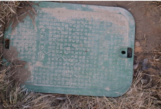
Figure 3. Correctly placed valve cover.

efficient way to accomplish this. (Most manufactures have online versions of the manuals available to consumers.) Once the zone is running, here's what to look for: