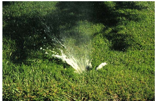
Figure 6. Sunken sprinkler head and distorted spray pattern.

Broken, tilted, or sunken heads: The most frequent locations to see problems with sprinkler heads will be along driveways or other places that receive heavy traffic or are prone to being run over by vehicles. Tilted sprinkler heads change the angle of spray and reduce application uniformity. The spray pattern on a sunken head is blocked because it is too low in the ground, also reducing uniformity (Figure 6). Watch for puddles or water running off from broken or leaking sprinkler heads. Another problem common problem with rotary sprinklers is damage or excessive wear over time, causing them to either stop rotating or freeze part way through a rotation. These sprinklers should be repaired or replaced.