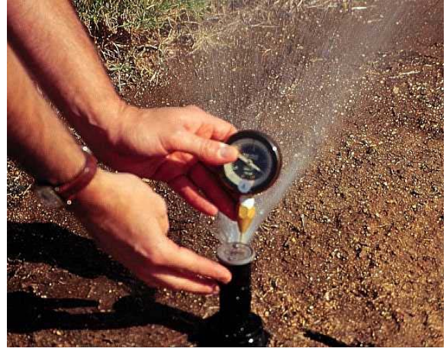
Figure 9. Testing sprinkler water pressure with a pitot tube and gauge.

problem causing reduced sprinkler coverage and uniformity.