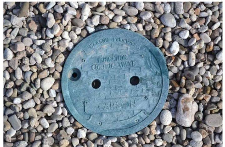
Figure 4. Example of what a shut off valve box might look like.

There are many different types of filters. In most cases, they can be cleaned relatively easily. Some types of filters have a valve which can be simply turned on while they are under pressure and they flush themselves out. Others need to be taken apart and cleaned. Once disassembled, filters can then usually be washed off with a hose and, if necessary, scrubbed with a nylon brush to remove hard to get material. IF TAKING THE FILTER APART, BE SURE TO TURN OFF THE WATER IN THE MAIN LINE FIRST!