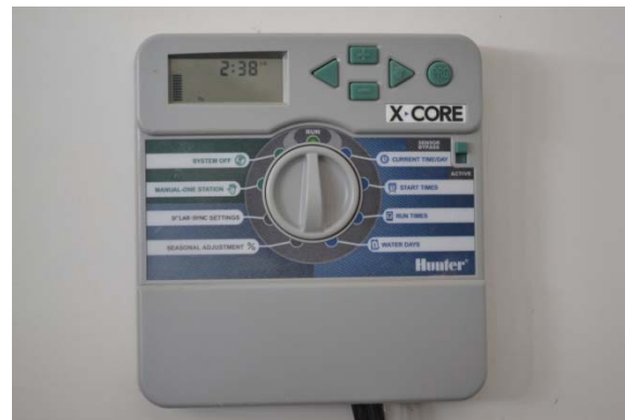
Figure 10. A typical automatic sprinkler controller.

http://extension.usu.edu/files/publications/factsheet/pub_975158.pdf