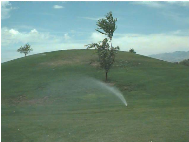
Figure 8. Wind blowing spray pattern off target.

Wind drift: If there is a consistent wind pattern (such as at the mouth of a canyon with strong morning winds) try to irrigate when the prevailing winds are calm. Wind can cause a potentially large drop in watering uniformity (Figure 8).