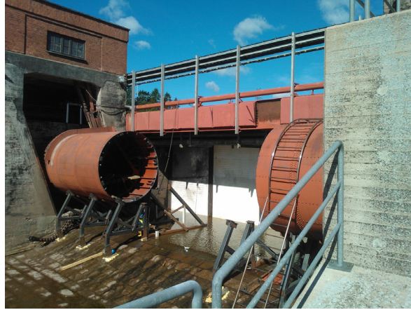
Figure 11. Needle and Infill Cofferdam, Myllykoski Hydropower Plant, Finland (Pato Osakeyhtiö)

Myllykoski Hydropower Plant in Finland utilized wide flange steel needles and stacked infill beams (webs horizontal in “H”-orientation). Vertical needles were installed from a small mobile crane 445kN (50-ton) from atop the original bridge completed in 1929. Needles were braced at the top by the bridge. Stacked infill beams were placed within the webs of the needle beams as shown in Figure 11. The system closed a gate bay approximately 5.4m-high by 18m-wide (18ft-high by 59ft-wide). Nearly all material was taken from the owner’s storage materials, and the layout of the needles was such that the infill beams did not require cutting. Rubber ribbons were used as seals between the stacked beams at the vertical needles and at the contact with the concrete at the base, resulting in almost no leakage. Despite stringent Finnish safety laws requiring a minimum of three divers working simultaneously, a two-week erection process limited the owner’s construction cost to roughly 25,000 to 30,000€.