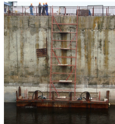
Figure 4. Saratov HPP Caisson, Russia (Hydroproject Institute)