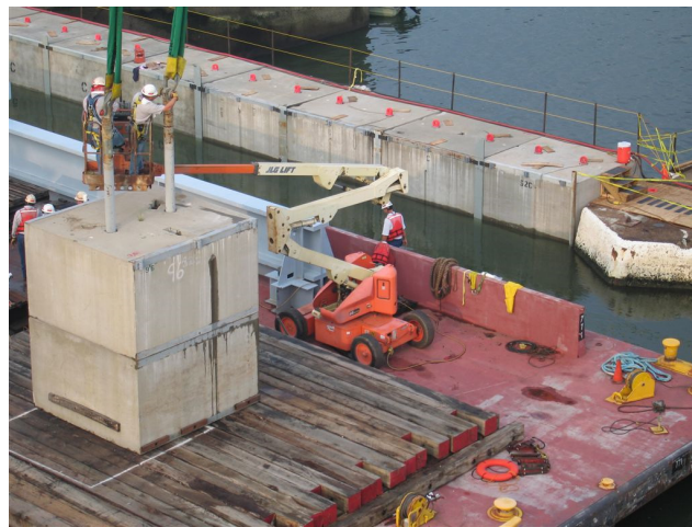
Figure 9. Stackable Precast Concrete Blocks, Locks and Dam No. 52, USA