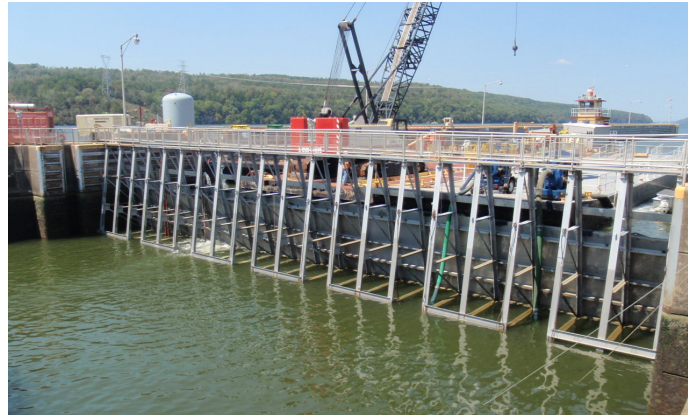
Figure 2. Poirée Needle Dam, Dardanelle Lock and Dam, USA

dams around the world, many of them are being replaced by more substantial, durable, and reliable systems. They are not typically considered for new designs, but some of the principles are manifested in modern MCS.