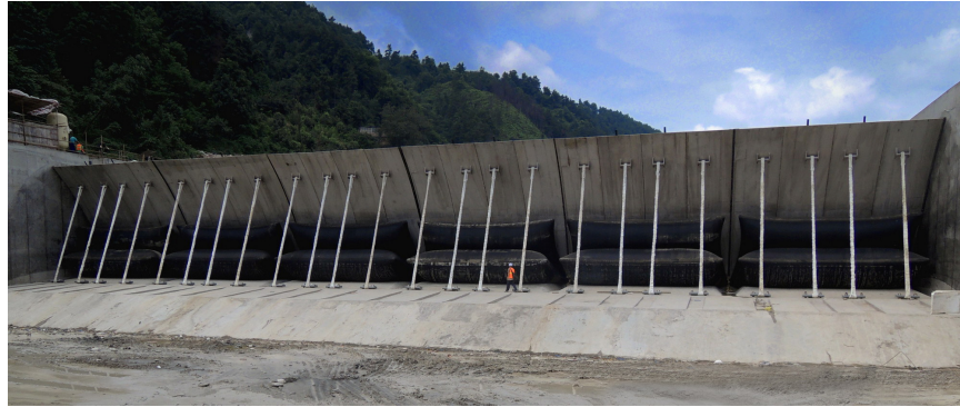
Figure 17. Nanming River Obermeyer Gate, China (Obermeyer Hydro)

The largest Obermeyer gate installation found was 8m (26.2-feet) high by 60m (197-feet) wide at the Nanming River in Guiyang, China (Figure 17). Current Obermeyer gate production is suited for heights up to 10m (32.8-ft). Taller gates are technically feasible but with increased cost (Robert Eckman, personal communication, January 11, 2016). To date, no installations of inflatables for the sole purpose of dewatering another gate were found. However, inflatable systems are more cost competitive on a per square meter basis with other MCS types if maintenance can be limited to low flow seasons such that the required MCS height is much less than the spillway gate.