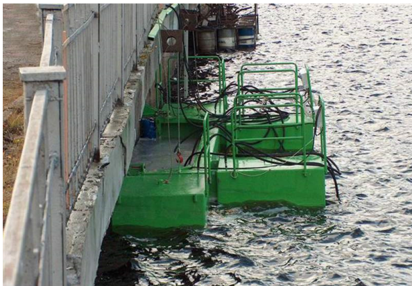
Figure 3. Nizhny Novgorod HPP Caisson, Russia

Steel caissons are commonly used in Russia to perform concrete and gate repairs on the upstream face of a dam, such as Nizhny Novgorod HPP (see Figure 3). The caisson is towed by boat in a horizontal position, using floats for buoyancy, and ballasted to an upright position against the face of the dam. Water is pumped out of the caisson, sealing the caisson against the concrete using hydrostatic pressure and creating an underwater enclosure to make concrete repairs in the dry. A steel caisson, approximately 6m (19.7 ft) tall, was used at the Saratov HPP in Russia. It was towed into place and anchored by divers (see Figure 4). Although other caisson systems have been used against more complex sealing surfaces (e.g., repairing sheetpile with the Acotec DZI Limpet Cofferdam [Acotec 2015]), use of caissons to seal directly against portions of large, irregular-shaped spillway gates presents design and worker safety challenges.