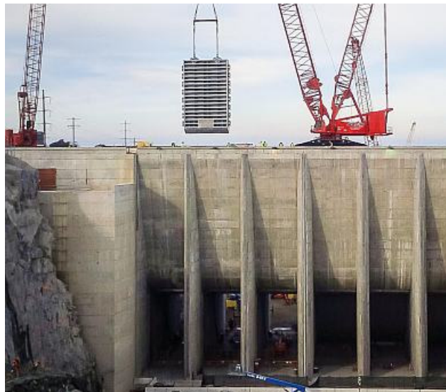
Figure 15. Folsom Spillway Bulkhead, USA (U.S. Bureau of Reclamation/USACE [Frank 2015])

These bulkheads are often stored in vertical slots in the spillway located upstream of the spillway gates and lowered into place to isolate the spillway gates when needed. In some cases, the bulkhead is a spare gate identical to the permanently installed spillway gates. In other cases, a separate bulkhead is installed upstream of each spillway gate so that each gate may be isolated individually. In cases where the bulkhead is not permanently installed in slots upstream of each gate, the bulkhead is transported using a movable crane that travels along the top of the spillway capable of transporting the bulkhead between bays and lowering it into the vertical slots. These bulkheads are usually part of the original design and construction of the spillway. The bulkheads have a large initial cost and are difficult to retrofit, but they are easily deployed, reliable, and capable of being deployed in emergency situations. Vertical lift gate bulkheads are being used at many new, large spillways, including Folsom Dam Auxiliary Spillway project in California, USA (see Figure 15).