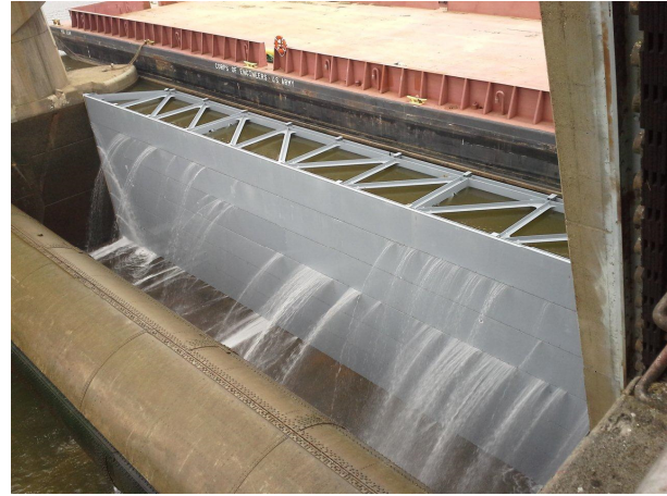
Figure 13. Stoplogs at Winfield Locks and Dam, USA