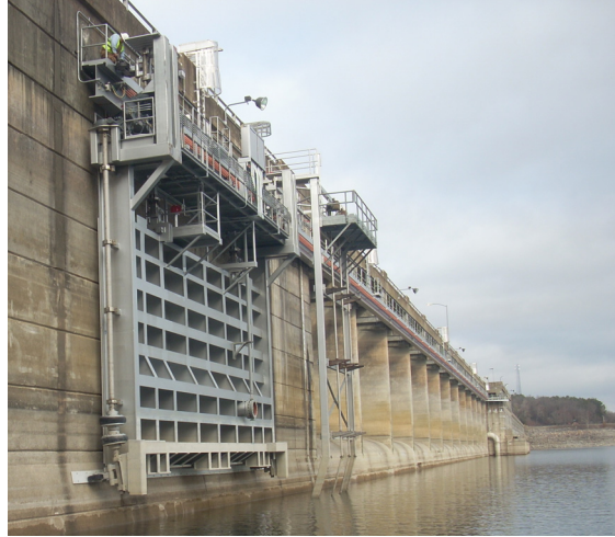
Figure 10. Norfolk Dam Rolling Bulkhead, USA (USACE Little Rock District)

Norfolk Dam in Arkansas, USA, an example of a rolling bulkhead, is shown in Figure 10. The 578kN (65 ton) maintenance bulkhead runs along a 203.3m (667-foot) long steel monorail beam attached to the dam. The bulkhead was shipped to the site in two halves, which were assembled on site, transported along the length of the dam in the upright position using two trucks travelling parallel (one to each side of a median), and lifted onto the monorail using two cranes placed on top of the dam. Motorized trolleys slide the 7.3m-high by 14.6m-wide (24-foot high by 48-foot wide) bulkhead in front of individual gate bays. As the bay is dewatered, unbalanced pressure pushes the bulkhead against the structure and holds it in place. Bolted connection brackets were fastened to the existing dam pier caps using high-capacity, deep-embedment post-installed concrete anchors (Garver 2012). Within approximately 5 minutes, the bulkhead can be moved from one gate bay to the next.