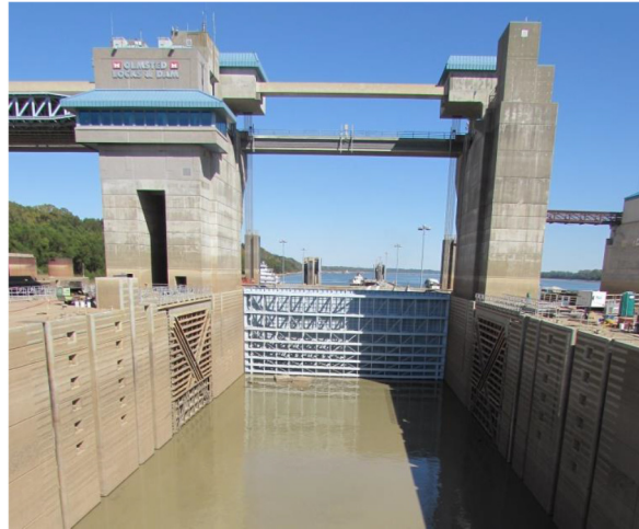
Figure 6. Operational Bulkheads at Olmsted Locks and Dam Project, USA

open position. Each bulkhead is 34.7m long by 15.2m tall (114-feet long by 50-feet tall). The hoisting equipment is located in machine houses cantilevered out over the lock chambers approximately 27.4m (90 feet) below.