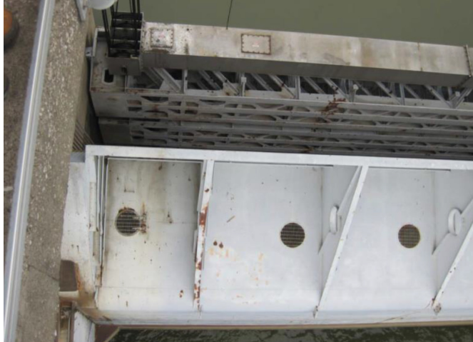
Figure 14. Emergency Bulkhead at Cannelton Locks and Dam, USA