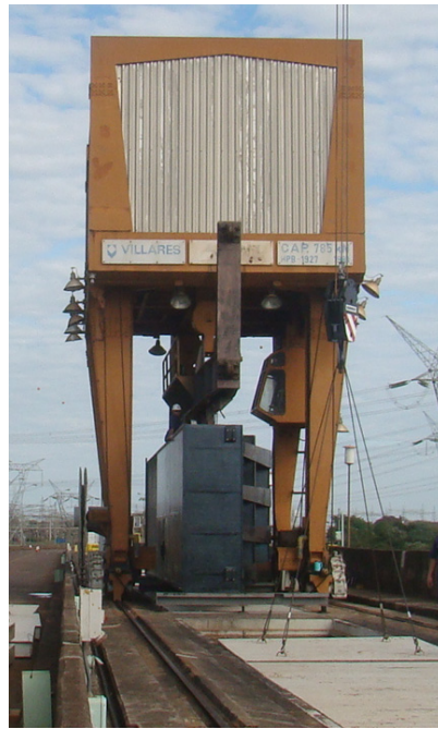
Figure 1. Stoplog Install, Itaipu Dam, Brazil/Paraguay (Itaipu Binacional)

The type of MCS in use around the world varies based on the specific characteristics of each individual site. However, our research discovered some trends attributable to certain geographical areas or organizations. Several fairly recent publications were found on this topic, including PIANC Working Group 26's Design of Movable Weirs and Storm Surge Barriers (PIANC 2006), Design of Hydraulic Gates (Erbisti 2014), and United States Army Corps of Engineers ERDC/GSL TR-10-44 (Padula 2010) and ERDC/CHL TR-12-8 (USACE 2012). These publications provide an overview of some types of systems employed, case studies, and key design aspects.