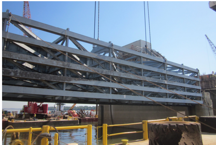
Figure 5. Bulkhead Installation at Olmsted Locks and Dam Project, USA

One-piece drop-in bulkheads are fabricated and deployed as a single, full-size structure. No field assembly is required. One-piece bulkheads typically consist of one large steel space frame truss, which is lifted by a large crane (or two), with the crane(s) often mounted on a barge. Bulkhead load bearing, similar to a stoplog system, usually transfers hydrostatic load to the piers. The steel framework consists of interconnected horizontal spanning trusses with a steel skin plate on either the upstream or downstream face. Bulkheads tend to be more robust towards the middle (horizontally) to resist maximum bending moments and less so at the supports where moments are small. Bulkheads often bear in slots in the concrete piers. The primary advantage of this type of structure is that it may be installed within a few hours because it is a single unit. However, it may require large cranes for installation. The largest one-piece drop-in bulkhead discovered in our research was at Olmsted Locks and Dam Project in the USACE Louisville District, which is 35.1m long by 11.6m tall (115-feet long by 38-feet tall) and is shown in Figure 5.