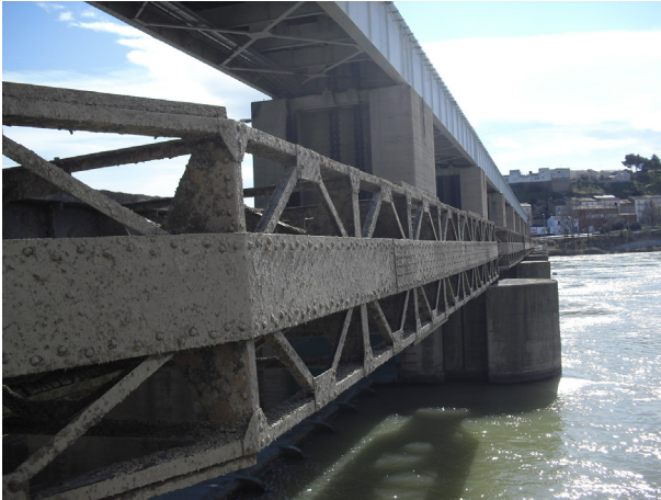
Figure 12. Flix Dam Stoplogs, Spain (Endesa)

web openings to be reused as gusset plates. After installation, there was some leakage at the seals (see Figure 13), presumably due to storage directly on their seals, causing permanent compression. In some cases, leaks may be reduced using straw, horse manure, oakum, granite dust, sawdust mixed with oil, or blast furnace slag (Softley 2008). In other cases, repairs or new seals are needed. Leakage at seals should be expected, and tolerable limits should be established depending on the type of work. Environmental regulations should be considered when selecting a method for sealing leaks.