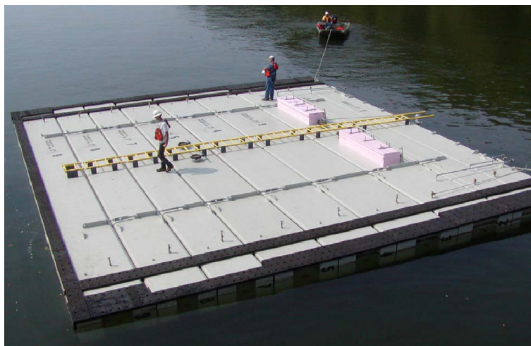
Figure 8. Hinged Floating Bulkhead, USA (Tennessee Valley Authority)

Hinged floating bulkheads operate like an overhead garage door. They consist of parallel steel tubes or built-up sections that have internal ballast chambers and are hinged together between each segment. Bulkheads are floated to the gates from upstream while in the horizontal position. Ballast chambers are filled with water one by one, sinking the individual segments into place against the upstream face of the structure (Lux 1995). Installation of these bulkheads usually requires towing by a small boat (or two). Reservoir levels must be high enough to allow proper placement of the bulkhead after ballasting to the upright position. Expected range of reservoir levels should be accounted for in design of the ballast to ensure placement. Bulkheads are often anchored only at the two top corners with hanger brackets mounted to the face of the spillway to secure the bulkhead in the event the pool is lowered. One advantage of a hinged floating bulkhead over a rigid floating bulkhead is that the individual sections can be designed to be detachable. This allows the number of sections to be tailored to each dam. Also, the small sections are more easily lifted and handled with the use of smaller equipment. The Tennessee Valley Authority in the United States has hinged floating bulkheads for use at twelve of its sites. The floating bulkheads consist of caissons with ballast chambers that may be combined as needed for use at different sites with various gate sizes as shown in Figure 8.