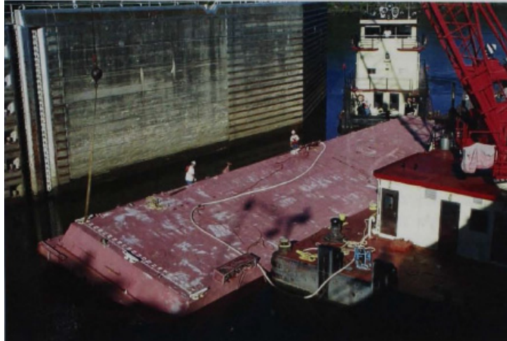
Figure 7. Floating Caisson Being Ballasted, USA (USACE Nashville District, ERDC/GSL TR-10-44)