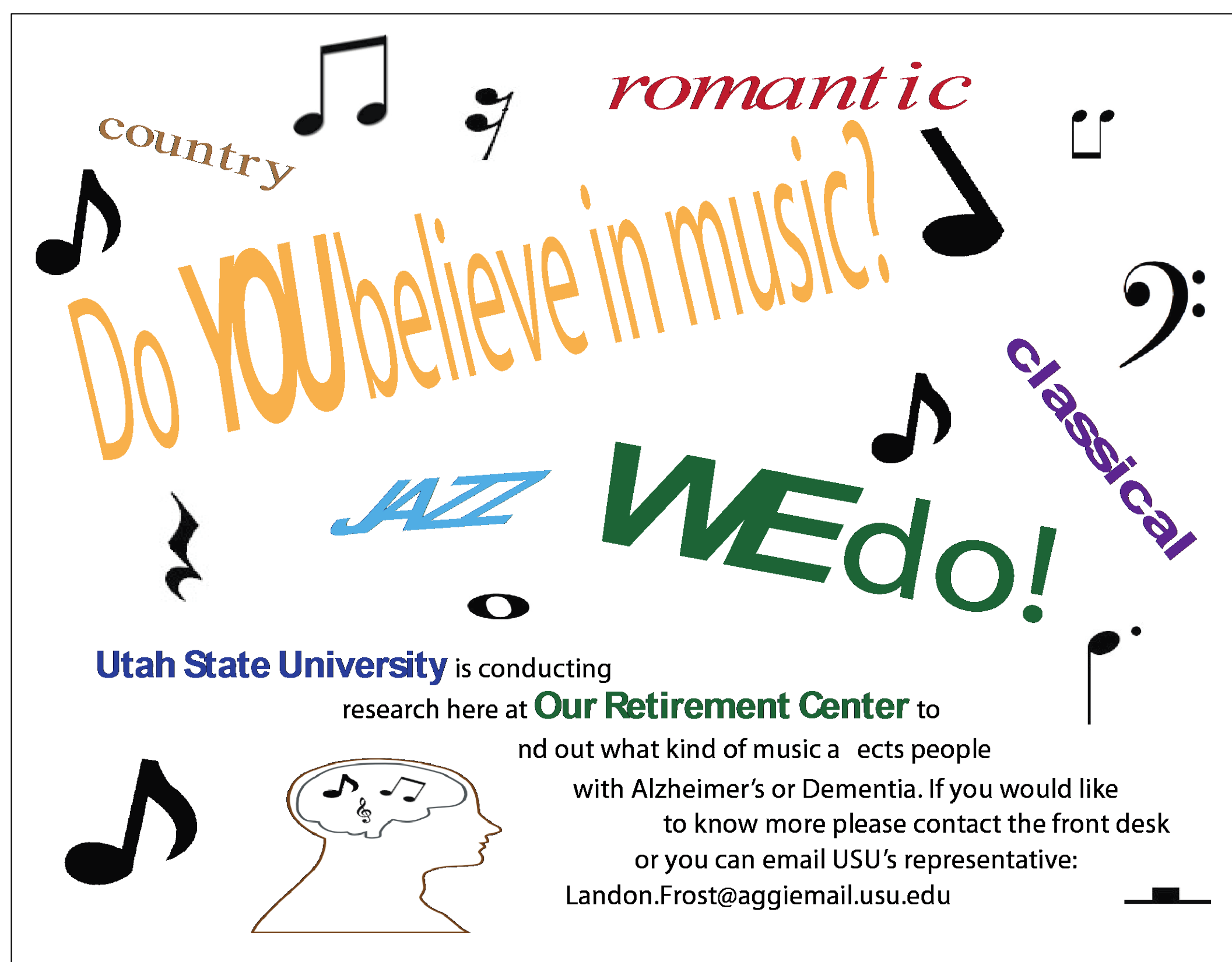
Advertisement used to obtain subjects

Introduction: Music has been shown to trigger old memories and induce various levels of stress relief and relaxation. My research focused discovering which songs had the greatest effect on this cohort in Cache Valley.