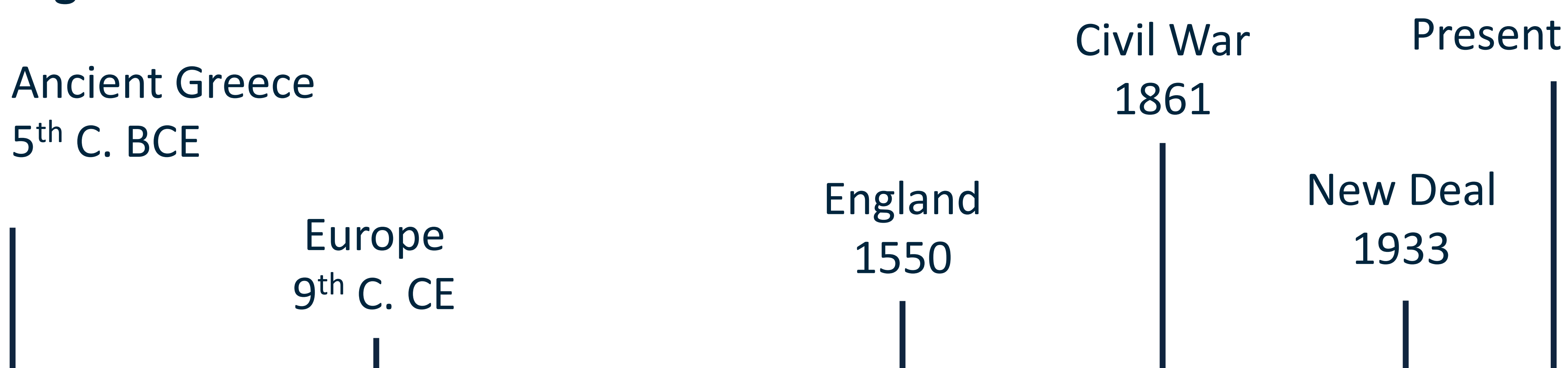
Figure 1 – Educational Timeline