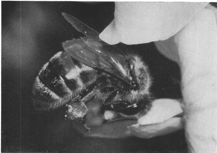
FIG. 3.—Honey bee collecting pollen from Colutea .

A pollen-collecting honey bee is shown in figure 3. She perches on the apical half of the keel and pries it open with her legs and mouth parts. Since her weight is toward the apex of the keel, the piston mechanism is probably at least partially operated. The effectiveness of honey bees as bladder senna pollinators obviously depends upon the percentage of pollen collectors. Nectar-collecting honey bees apparently never pollinate the flowers accidentally, as they sometimes do when visiting alfalfa.