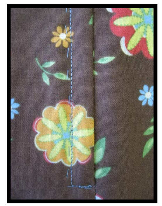
STEP 8: Remove machine and hand basting stitches and open the placket to reveal the zipper.

STEP 7: Now using a regular machine stitch, and still working from the right side of the garment, topstitch through the garment, seam allowance, and zipper tape, backstitching at each end. Follow close to the basting stitch, beginning from the bottom seam. Sew several stitches along the bottom, turn and stitch up the side to the top of the garment.