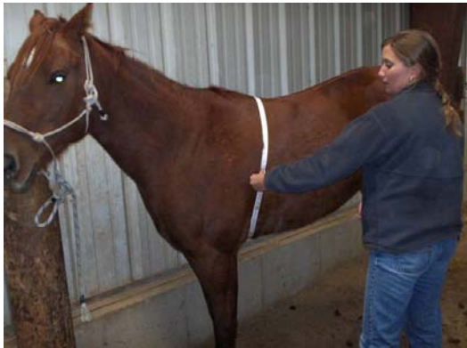
Figure 1. Weight tapes are used to get an estimate of the horse's weight for medications and de-worming. Some tapes go behind the elbow and over the top of the withers while others, like this one, go behind the elbow and withers. Reading instructions for proper use is important.

Using a weight tape (which can be obtained at many feed stores or through a feed company) will give a more accurate indication of weight than eye-balling (Figure 1). Because the tapes are not 100 percent accurate, it is appropriate to add 200 pounds to the reading for adult horses, thus giving enough dewormer to cover the weight-tape weight plus the 200 pounds.