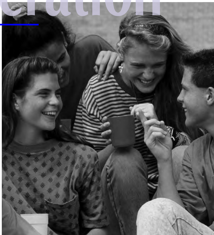
Figure 2. Six steps towards a degree in special education at Utah State University.