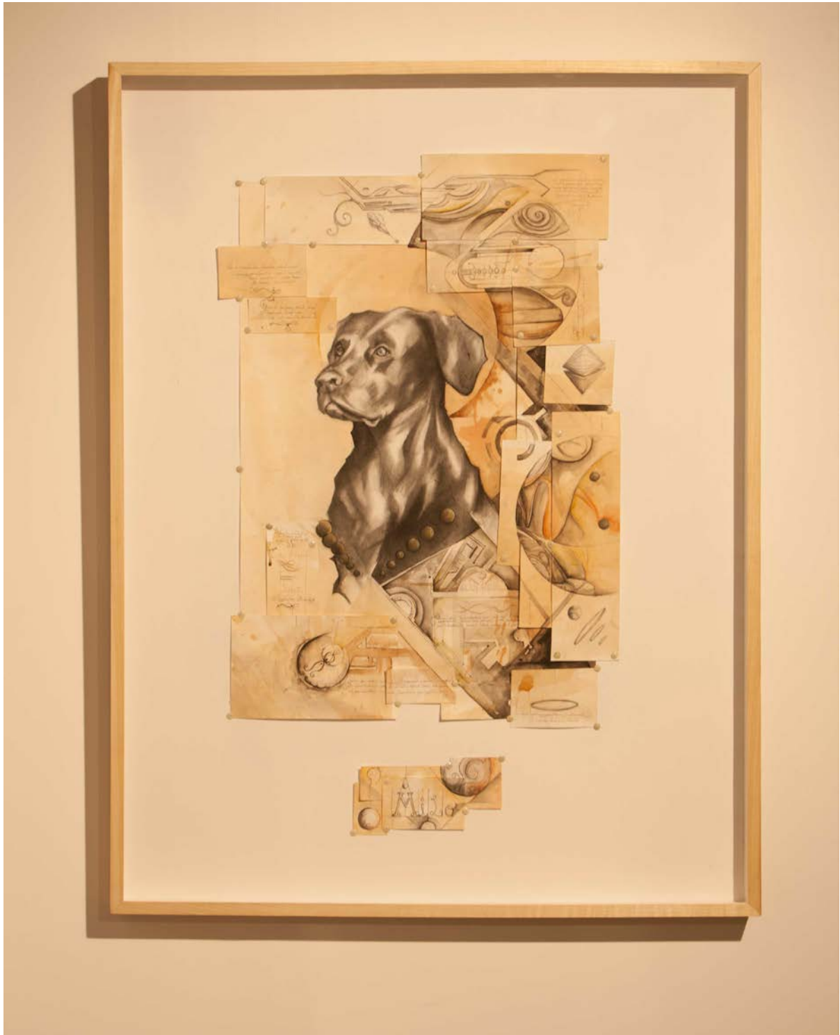
Dog Portrait Title: Milo Medium: Graphite, charcoal, watercolor, pastel.