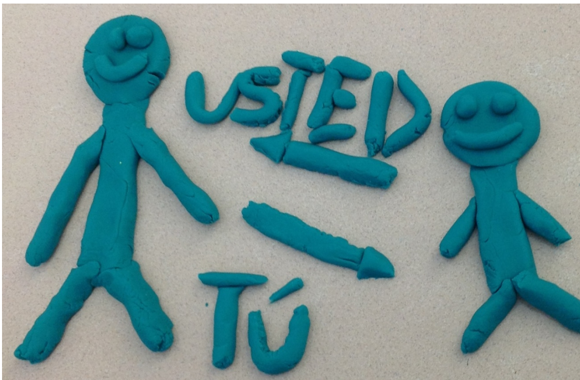
Figure 3. Example of showing respect to elders (as explained by the student).

Once students completed presenting and evaluating the models, I asked students to modify their model to show how similar people would use different pronouns in a different scenario. This asked students to make minimal modifications to the actual model, only enough to show the change in scenario. For example, the change between Figure 3 and Figure 4 involved moving the arm around the younger person to signify a close family relationship where the formal pronoun would not be used. These small modifications allow students to “continuously create the environment, even as [they] learn it” (Holzman, 1995, p. 204).