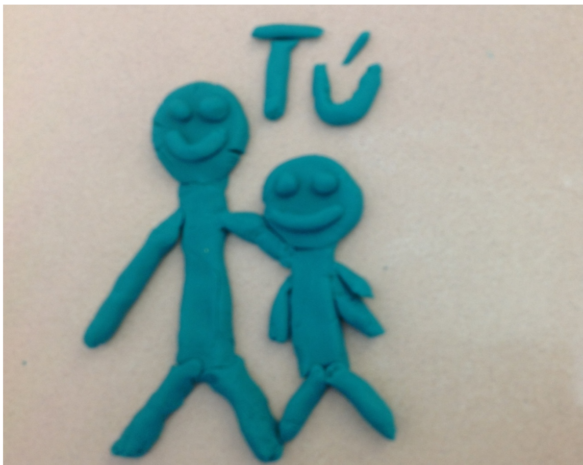
Figure 4. Example of how within family and other relationships the formal usted can be replaced with the informal tú (as explained by the student).

to the woman, while the woman would use it to show a lack of interest and social distance. The evaluating group argued that the man would use tú to show a closeness and interest in the woman. After some discussion, the modeling group agreed, and altered the scenario to be two strangers, who are showing both respect and social distance. This is an excellent example how students provided feedback to each other to work in the ZPD and better mediate their learning.