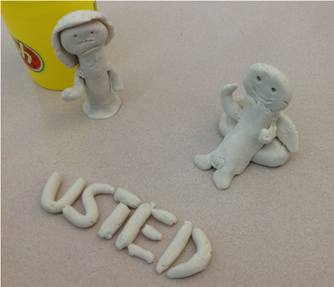
Figure 5. Example of used to show social distance (as described by student).

the people, providing more complex and interesting examples than I would have had time or the creativity to present to them in class.