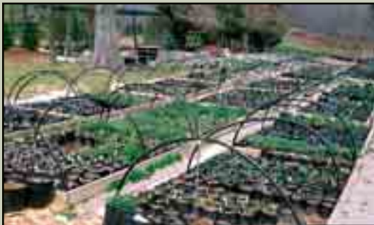
Containerized Native Plants for Rehabilitation Plantings

Using National Fire Plan funds and State and Private Forestry Forest Stewardship Funds, the Forest Service has partnered with the State of Utah, Ephraim City, Rocky Mountain Elk Foundation, and other organizations to construct a 17,100-square-foot facility that will store up to 500,000 pounds of native seed to be used for fire rehabilitation, wildlife habitat improvement, and other projects.