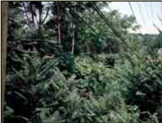
Tree of Heaven Infestation Impacting Powerline Right-of-Way