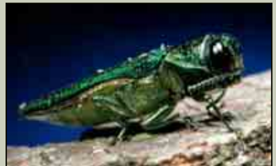
Emerald Ash Borer