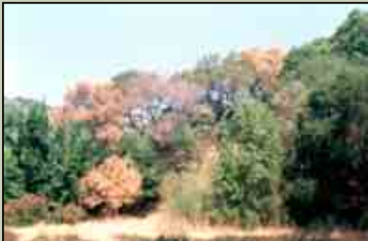
Damage from Sudden Oak Death

Existing Forest Inventory and Analysis and Forest Health Monitoring programs for all forested lands in the Nation, including urban areas, now include invasive plant species monitoring and analysis.