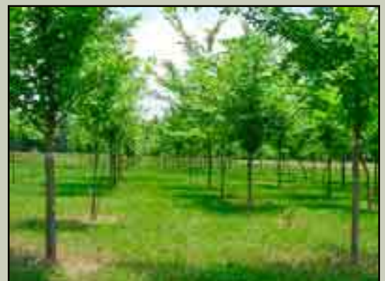
Trees Resistant to Dutch Elm Disease

The Forest Service (Samman et al. 2003) has a strategy for protecting, sustaining, and restoring white pine ecosystems devastated or threatened by white pine blister rust. The plan complements the Healthy Forest Initiative and the National Fire Plan. Options for control of the disease include pruning, silvicultural strategies focused on planting, and thinning and genetic strategies dedicated to rust resistance.