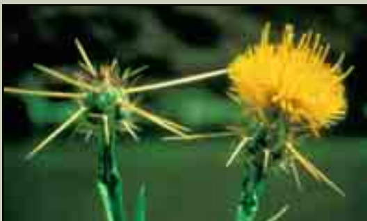
Yellow Starthistle Plant