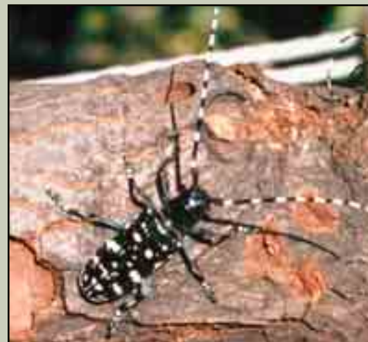
Asian Longhorned Beetle