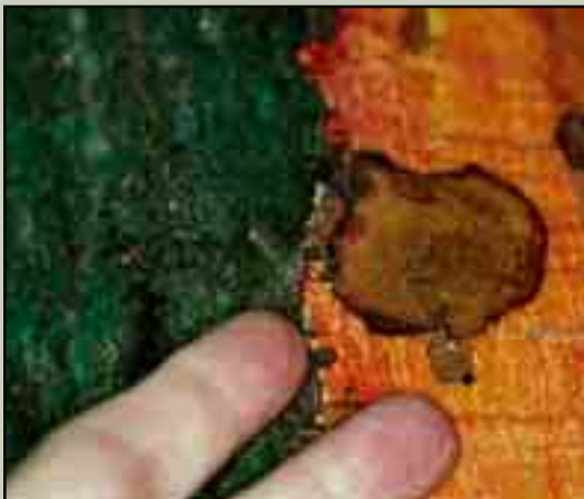
Sudden Oak Death Pathogen Damage