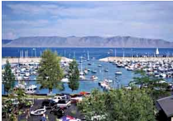
Bear Lake Marina