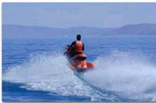
Jet Skis and Wave Runners are Popular Water Fun on the Lake

You can golf 3 seasons of the year in the Bear Lake Valley: spring, summer and fall. The golf courses are located on western hillsides overlooking the lake.