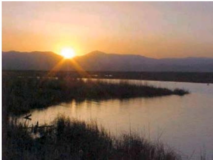
Bear Lake at Sunset

Bear Lake Rendezvous Beach is on the south shore near Laketown and provides 1.25 miles of wide, sandy beaches for camping, picnicking and watercraft activities. This beach is popular for large groups and is the site of the annual Mountain Man Rendezvous. Rendezvous' four campgrounds, Willow, Birch, Cottonwood, and Big Creek, contain a total of 178 campsites.