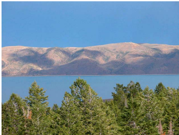
Bear Lake Looking East

The Utah Power and Light Company's capability to raise and lower the reservoir lead to erratic lake levels that caused resort visitation numbers to vary. High levels brought high-demands while low levels yielded a drastic reduction. In 1955 the joint compact among Utah, Idaho, and Wyoming was signed into law by President Eisenhower to address this problem. The Bear River Compact would be used to provide for efficient use of the water while promoting multiple purposes. Early in 1973 the Bear Lake Regional Commission was created. It was formed to assist in addressing problems related to impacts of growth in and specifically around Bear Lake.