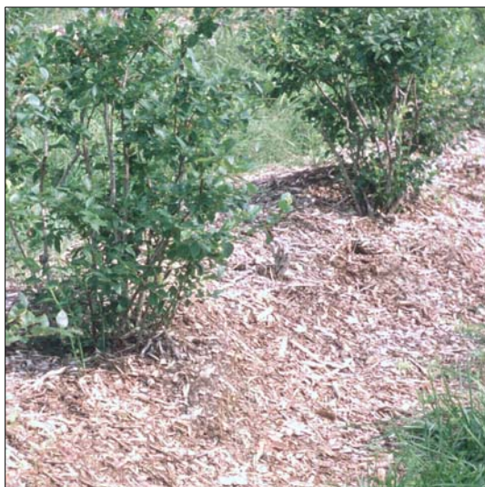
Figure 2. Highbush blueberries growing in a raised bed made up of decomposing wood chips, placed on the surface of a clay loam soil.

The fine fibrous root system of blueberry plants requires a coarse-textured soil. Blueberry root growth in acidified soils is often restricted by fine-textured soils (clay). The pH, nutrient availability, and physical properties (texture) of the soil environment can be improved using organic amendments. Interestingly, in some commercial plantings, repeated side-dress applications of organic amendments, such as wood chips, results in a mound of decomposing organic matter that essentially replaces the existing soil as a substrate for root growth (Figure 2).