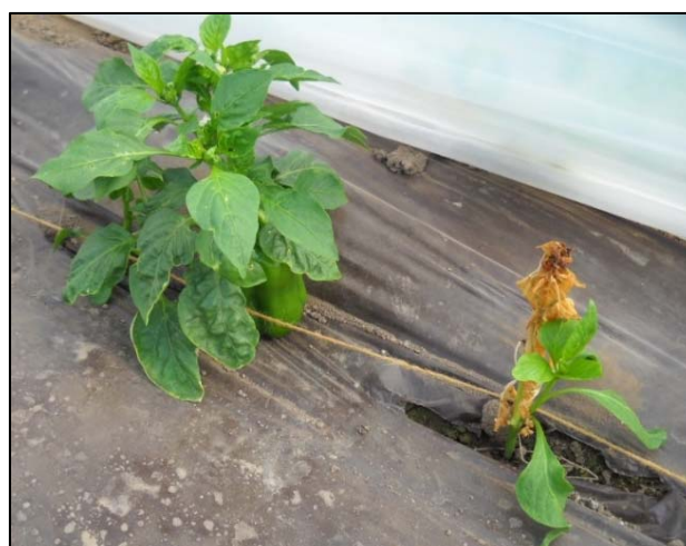
Image 1. Freeze injury on pepper results in replacement growth (or plant death) next to plant without injury.

Supplemental heating may be necessary to keep plants from chilling or freeze injury and may move