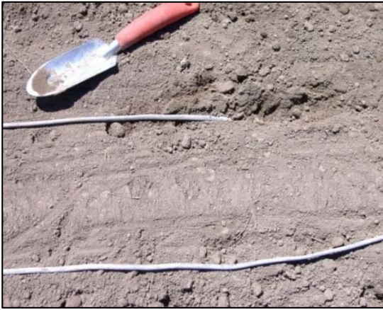
Image 2. Buried electric heating cables.