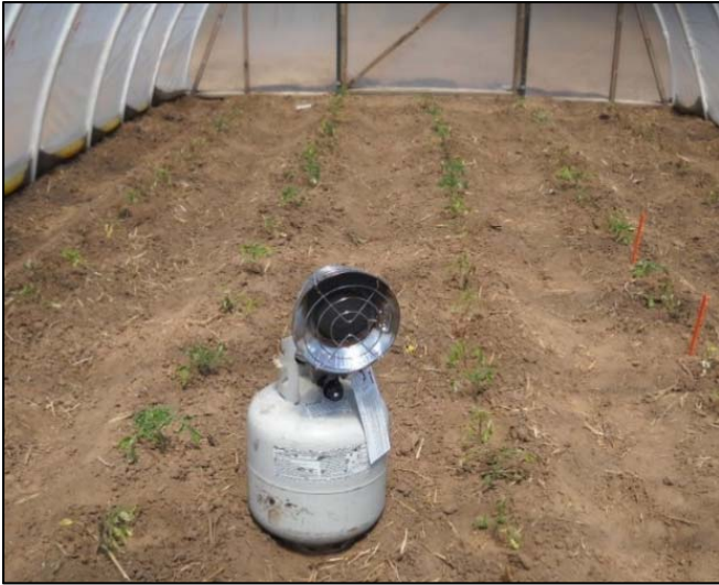
Image 5. Temporary propane heater.

affecting plant growth. The small amount of heat released at night, the loss of space, plus the cost of the barrels may not justify their use. Further, dark colored moist soil acts as a similarly-effective reservoir of heat storage, and has the added benefit of supporting plant growth.