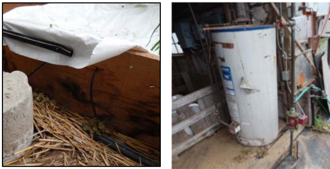
Image 3. Hot water is pumped through flexible tubing buried in the soil.

Heating cables can be purchased from various manufacturers (online) or, from local sources. Heat cables, if installed properly and handled carefully, can be reused for 2 to 4 years. They require an electricity source and care needs to be taken not to damage the insulation around the cable both during installation, and for the life of the planting. Cables are connected to a thermostat that can be set to different temperatures, depending on plant needs. When the soil cools to the set temperature, the cables will automatically turn on and begin warming the soil.