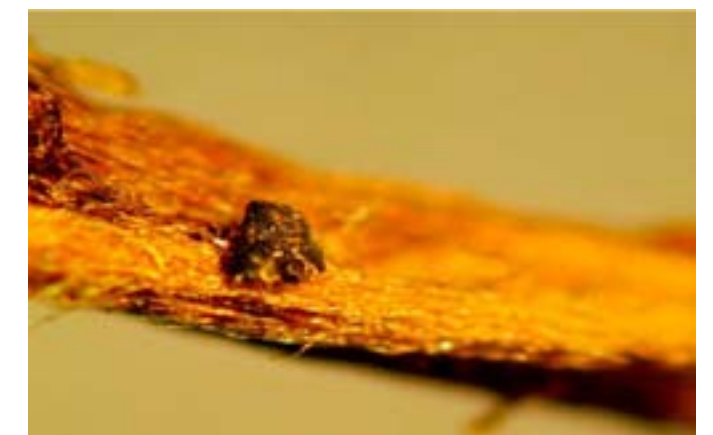
Fig. 7. A pseudothecium of necrotic ring spot embedded in a Kentucky bluegrass root. 2