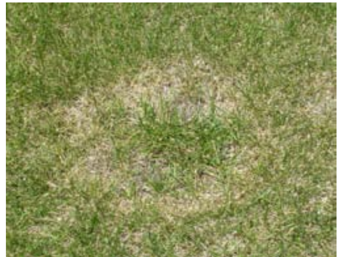
Fig. 1. Initial symptom of necrotic ring spot 1

when temperatures are still cool and soils are moist. Summer patch often becomes active later in the season (June-July) after temperatures have warmed up. In some areas of the lawn, NRS patches will disappear with higher temperatures, while in other areas infected patches may reappear under drought or heat stress. In the fall, NRS infection centers can reappear and may continue through winter and early spring. Symptoms of SP emerge during hot, wet weather (rainy days or heavy thunderstorms) in the summer. Symptoms from the previous summer of both diseases may still be visible in the fall and even the following spring. Recovery from both diseases is slow.