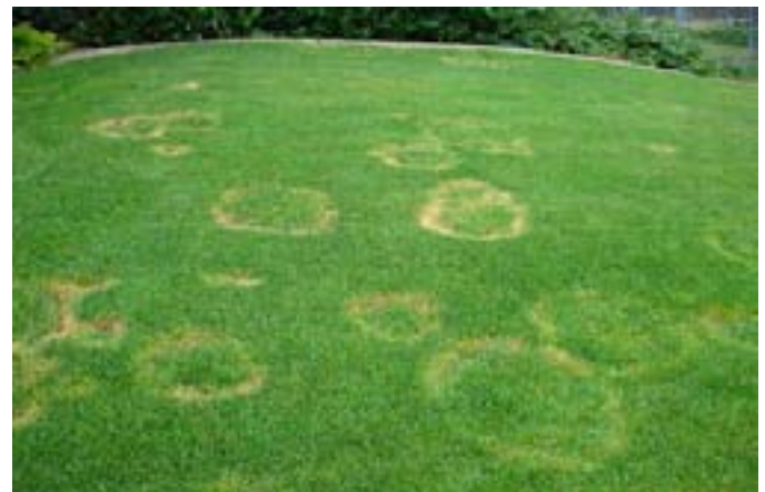
Fig. 2. Necrotic ring spot showing distinct separation and clearly defined areas. 1