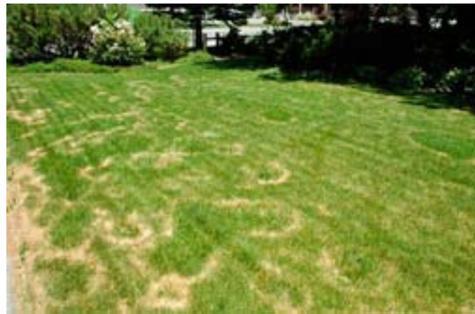
Fig. 3. A lawn showing more severe symptoms of NRS with coalescing rings. 2

To be certain that NRS or SP is causing the symptoms seen in turf, samples can be dug and checked for the presence of the pathogens (Fig. 7 and 8). Fruiting structures of NRS are rarely seen. For diagnostic purposes, roots are cleaned of soil and examined for growth cessation structures produced by SP (Fig. 8). If no growth cessation structures are found the disease is considered to be NRS. The Utah Plant Pest Diagnostic Lab ( http://utahpests.usu.edu/upddl/ ) provides sampling recommendations and accurate diagnosis.