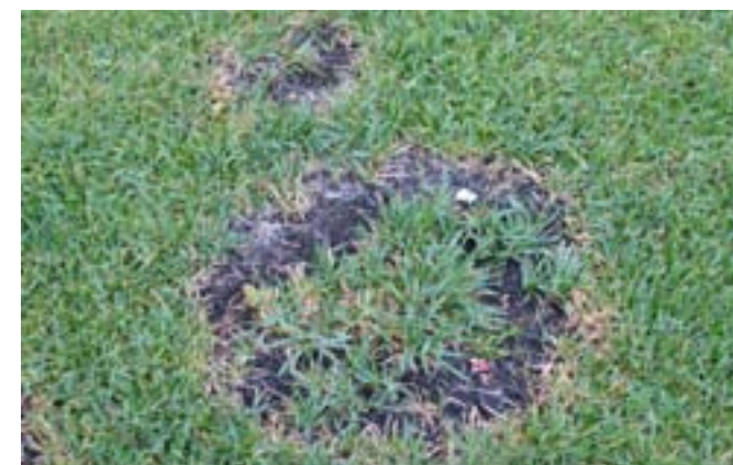
Fig. 4. Recolonization of infected area by turfgrass. 1

Turfgrass plants that are severely infected with NRS and SP can easily be pulled from the soil because of widespread rotting of roots, rhizomes, and crowns. These plants may then spread the diseases if they are moved by mechanical equipment utilized on the site. Effectively cleaning equipment with a power steam washer before moving to another location will help prevent further spreading of the disease. Where NRS and SP infections are severe and recurrent, preventive fungicide application may help suppress the development of NRS and SP, but timing of application is essential (see information under Fungicides).