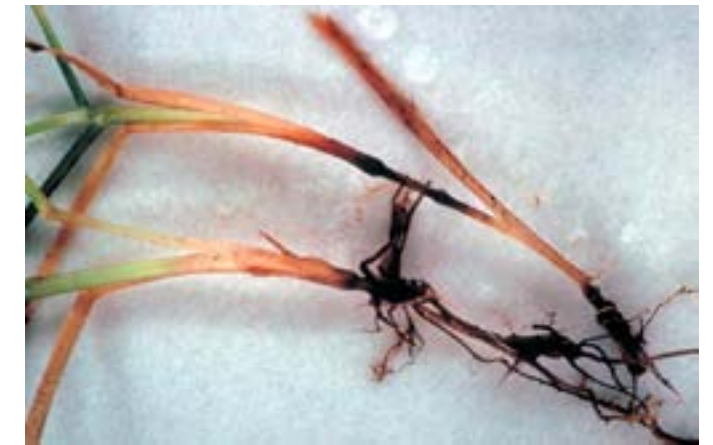
Fig. 5. Blackening of Kentucky bluegrass roots and rhizomes infected with necrotic ring spot. 3