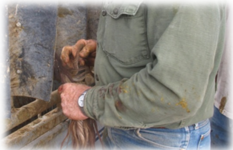
Figure 1: Pulling a hair sample.

DNA collection requires either a blood, tissue, or hair sample. One of the easiest methods to collect DNA is collecting tail hair. Hair samples of 20-30 hairs were pulled from the tail switch and placed in labeled, self-adhesive envelopes (Figures 1 & 2). Hair bulbs must be intact, as they contain the genetic material to be tested. Genetic profiling tests were sent to a Neogen Company called Igenity. The cost of the DNA profile analysis was $38 per head.