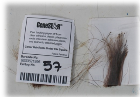
Figure 2: Hair collection envelopes.