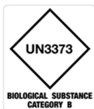
Figure 2. The "Biological Substance, Category B" label.

For "Biological Substance, Category B," this label must be present in letters at least six (6) mm high and must be marked on the outer package adjacent to a diamond-shaped UN3373 label.