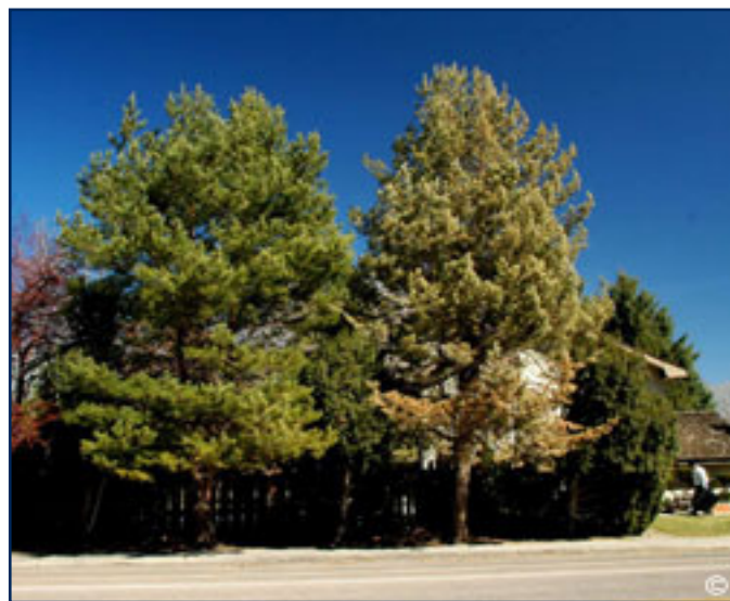
Fig. 3. Recently infested trees may not show obvious signs of fading 3 .

Look for signs of current or past beetle infestations such as galleries (Fig. 10), eggs, larvae (Fig. 12), pupae, and adult beetles. If galleries and larvae are present, this indicates a current attack. If the galleries are empty and no larvae, pupae or adult beetles are present, then the infestation is likely old. Note that some beetles, such as the western pine beetle, will