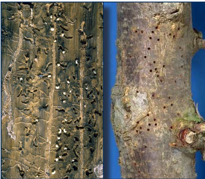
Figs. 10-11. (Left) Bark beetle parental and larval galleries; larvae can be seen in newly constructed pupal chambers where they will transform into adults 9 . (Right) Shotgun pattern of exit holes from shothole borers 6 .