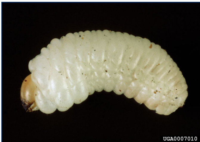
Fig. 12. Bark beetle larvae are legless white grubs with a brown head capsule 10 .

enter the outer bark layers in later larval stages. If the condition of the phloem layer (soft, white, thin layer between the bark and wood layers) is brown to black, or completely dried-up, then the tree may be dead. Check the rest of the circumference of the tree for live phloem. If no living phloem is found, the tree should be removed and treated to kill the beetles; see the "Sanitation" section for techniques.