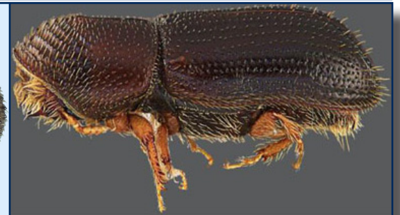
Figs. 21-23. (Left) Adult western balsam bark beetle 15 . (Middle) Adult Phloeosinus beetle 18 . (Right) Adult walnut twig beetle 19 .

The beetles in Figures 24 - 27 are mostly minor pests in Utah. The western balsam bark beetle mostly attack diseased or stressed fir trees at high elevations, but could affect white and other ornamental firs in the landscape. All records of Phloeosinus beetles in Utah are from ornamental Arizona cypress trees in Washington County.