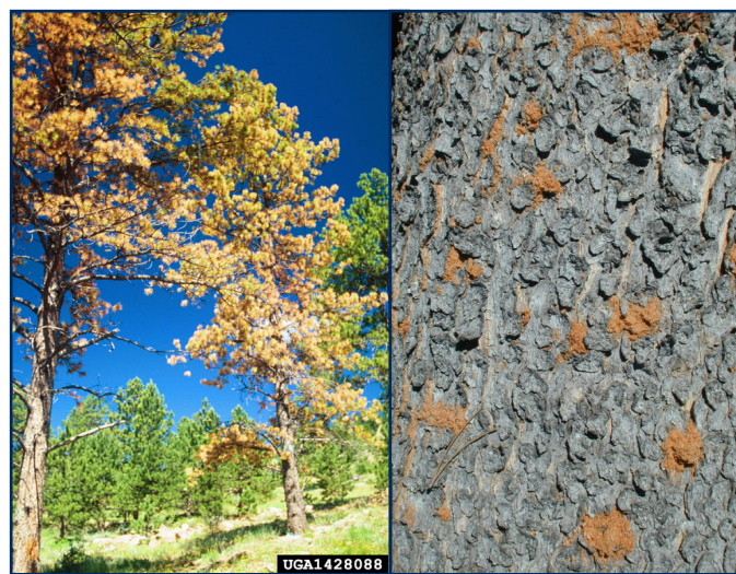
Figs. 4-5. (Left) Fading crown of bark beetle infested trees 2 . (Right) Frass, or sawdust-like material on the trunk is an indication of bark beetle infestation 4 .