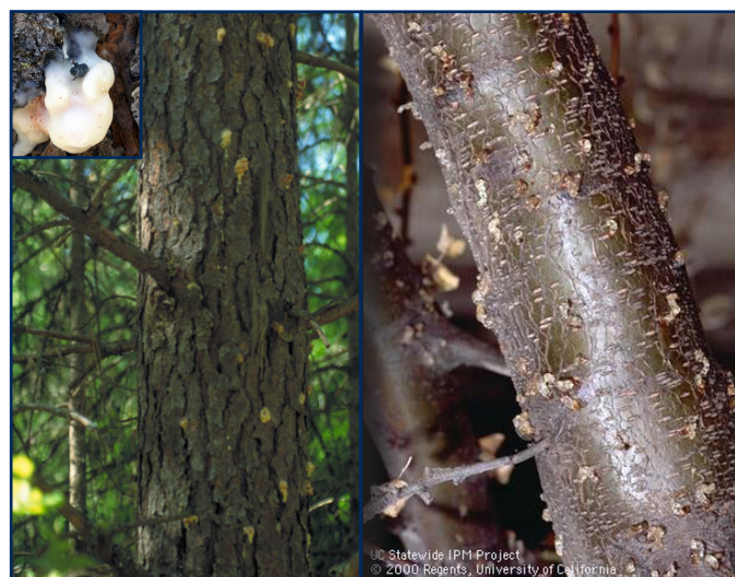
Figs. 6-8. (Left and Right) Pitch tubes are defensive chemical compounds exuded from the tree that may indicate bark beetle attack 5,6 . (Upper left corner) Bark beetle caught by a tree's defensive resin 7 .