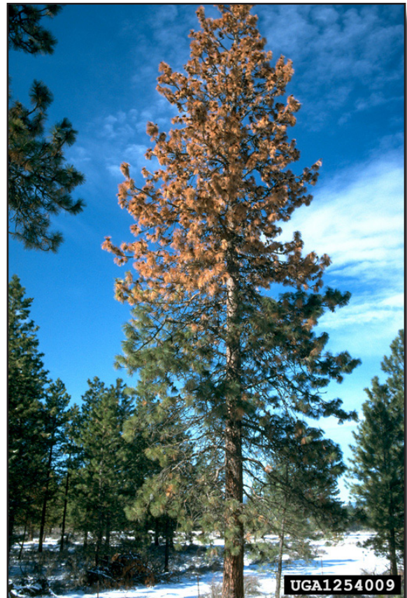
Fig. 2. Typical top-down dieback pattern on pines infested by Ips beetles 2 .

on the thin phloem layer just under the bark. As they feed, chemicals from their food are converted into attractive chemicals, signaling to other beetles of the same species that a suitable host was found.