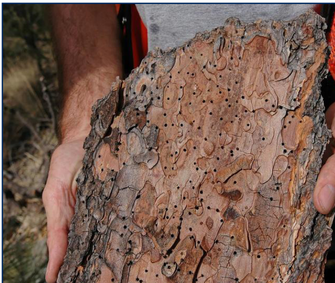
Fig. 9. Exit holes created from emerging adult bark beetles 8 .