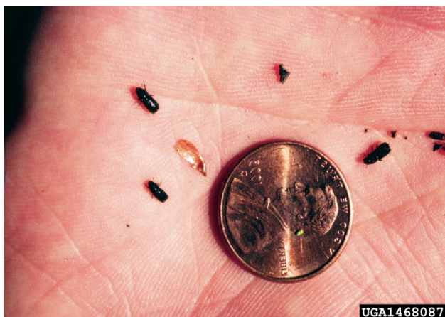
Fig. 1. Average size of an adult bark beetle compared to a penny 1 .

Bark beetles are one of the most destructive forest pests in the world. They are different than the larger longhorned and roundheaded/metallic woodboring beetles commonly infesting the inner wood of trees. The largest bark beetle, the red turpentine beetle ( Dendroctonus valens ), reaches only 8.3 mm in length. Because of their tiny size (Fig. 1), bark beetles are not effective tree killers as individuals. Instead, primary bark beetles work together, sending pioneer beetles to search for stressed or dying trees. When pioneer beetles find a weakened tree, they bore into and feed