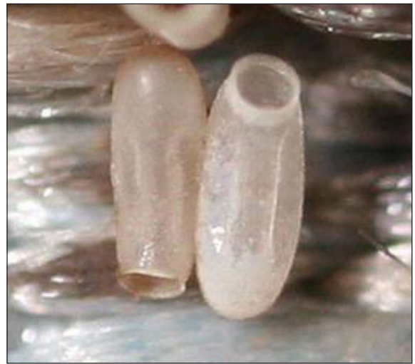
Fig. 4. Bed bug ( C. lectularius ) eggs (~ 1mm long) 1 .