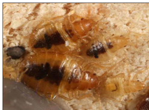
Fig. 2. Immature and adult bed bugs often huddle together. 1

Bed bugs are notorious around the world for their impact on humans and have been recognized as important pests for hundreds of years. Infestations were common before World War II, but heavy insecticide use eliminated most bed bugs in North America for almost 30 years. However, increased international travel and the removal of long-residual insecticides (DDT, Lindane) from the market have recently allowed bed bugs to make a comeback. The human bed bug, Cimex lectularius , (Fig. 1) is the most common species in the U.S. and Canada. Bed bugs are blood-feeding insects in the order Hemiptera and family Cimicidae. These insects are related to other fluid feeding true bugs such as squash bugs and boxelder bugs, but are closely associated with warm-blooded animals like humans.