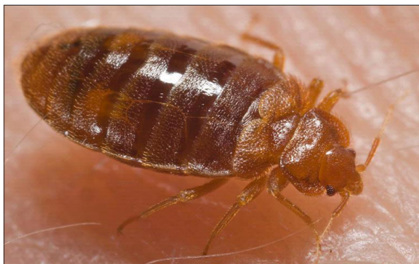
Fig. 1. Adult bed bug Cimex lectularius . 1