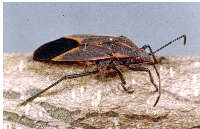
Fig. 2. Adult boxelder bug 1