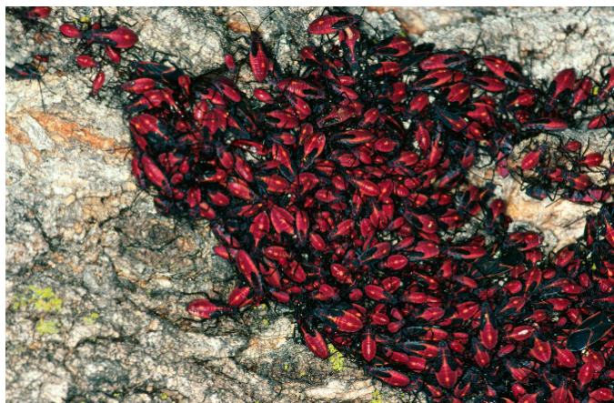
Fig. 1. Mass grouping of immature boxelder bugs 3

Boxelder bugs can feed and develop on many different kinds of plants, including maple, ash, stonefruits (cherry, plum, peach), apple, grape, strawberry and grass. However, large numbers are typically found on female boxelder trees where nymphs and adults feed on developing seeds (Fig. 1). Boxelder bugs are not usually found on ornamental plants, but have been known to damage fruiting trees during the late summer. Homeowners do not necessarily have to have a boxelder tree to notice adults around the home because they are mobile insects.