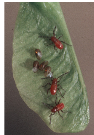
Fig. 3. Boxelder bug eggs and nymphs 2

The immature nymphs are wingless, but otherwise generally resemble the adults. When first hatched, small nymphs are completely red and sparsely covered with short, bristly hairs (Fig. 3). Slate-colored or black markings, particularly toward the head, appear when they are about half-grown. Large nymphs have obvious wing pads and black antennae and legs (Fig. 1).