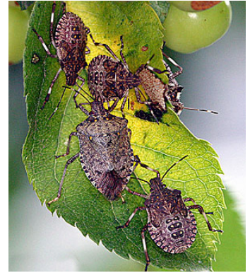
Fig. 4. Adults congregate using a pheromone cue. 4