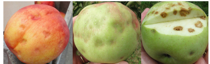
Fig. 2. Feeding causes necrotic lesions and pits. 2

Adult BMSB are strong fliers and adept hitchhikers. They can move from one host site to another in just a few hours. Like other "true bugs," they feed by inserting their straw-like mouthparts into the plant to suck out the sap. BMSB will feed on leaves, seeds, fruits, and even through the bark of young trees. Feeding causes areas of collapsed tissue that becomes dried and necrotic (dark colored), and can also introduce disease pathogens into the plant. On crops such as tree fruits and some vegetables this damage is generally visible on the surface as necrotic lesions (Fig. 2), but BMSB feeding can also cause deeper, less obvious damage. Some growers have found that a crop that was seemingly clean at harvest will show damage after 4-5 weeks in storage.