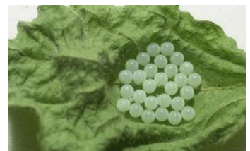
Fig. 5. Eggs are pale green and laid in a cluster. 5