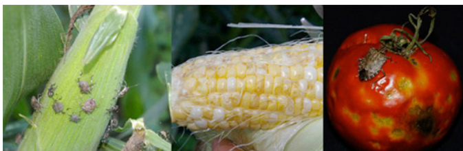
Fig. 8. Injury to corn and tomato. 8

In addition to feeding on a wide range of plants, BMSB adults seek shelter to spend the winter. Very large numbers congregating on and inside homes, schools, office buildings and other structures have caused a major nuisance to humans (Fig. 9).