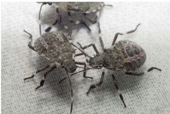
Fig. 7. Late nymphs are almost black in color. 7