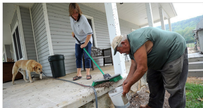
Fig. 9. Cleaning up BMSB from a home porch in Maryland. 9

BMSB can squeeze into narrow cracks and crevices, so seal entry points into homes and other buildings with caulking. Place and repair screens on windows, doors and vents; and remove or seal around window air conditioner units. Mechanically remove adults congregating on exterior surfaces or within buildings with a vacuum or broom (Fig. 9).