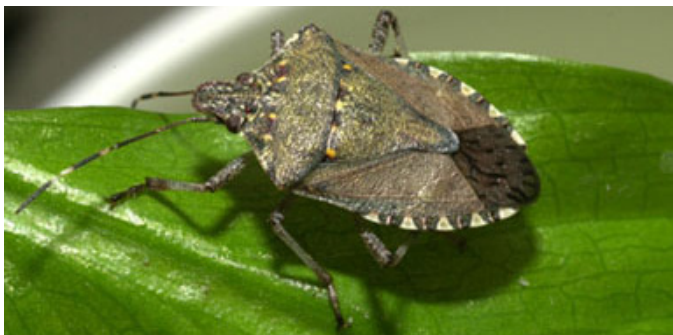
Fig. 1. Adults are shield-shaped, brown, and 5/8 inch long. 1

B rown marmorated stink bug (Order Hemiptera: Family Pentatomidae) (BMSB) (Fig. 1) was accidentally introduced into the eastern U.S. from Asia in the late 1990s. In 2001 it was officially identified in Pennsylvania, and has since spread along the eastern seaboard and westward into the Great Lakes region. In 2002 it was found in Portland, Oregon, and has since spread to localized areas in Washington and California. It has not yet been found in Utah, but it is likely only a matter of time before it will occur in most states due to its rapid adaptation to a wide range of climates. Since 2004, BMSB has gained notoriety as a major nuisance due to large aggregations of the bugs invading buildings in the fall to overwinter, attracted to the protective warmth.