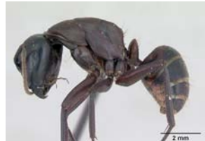
Fig. 12. C. hurculeanus . 1