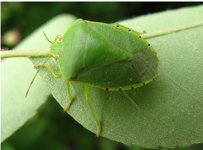
Fig. 5. Green stink bug adult.