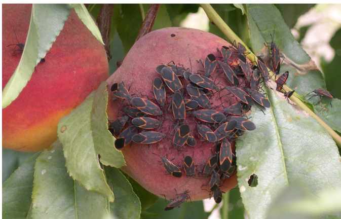
Fig. 7. Boxelder bugs congregating on ripe peach fruit. 3