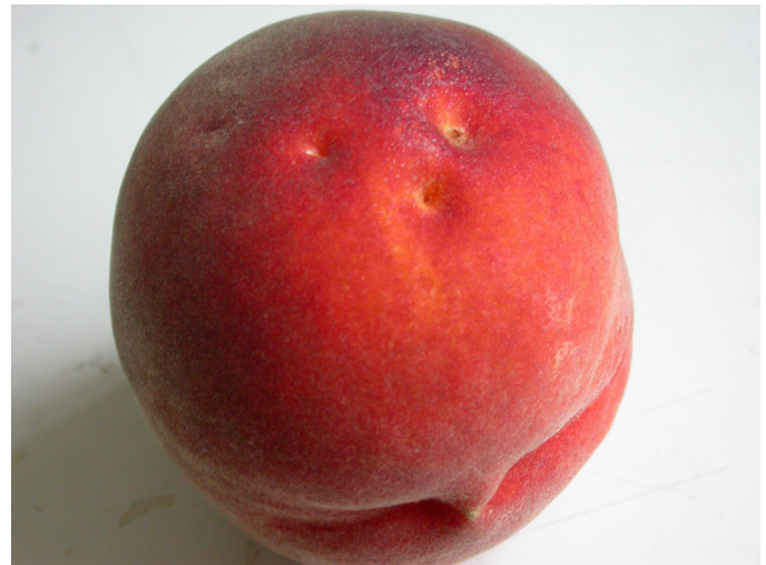
Fig. 6. Late-season cat-facing insect injury to peach.