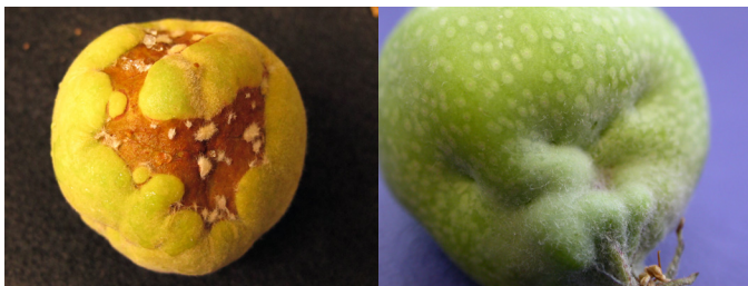
Fig. 1. Early-season cat-facing injury to peach fruit.

There are a number of insects with the piercing-sucking feeding habit that can cause deformity and cat-facing type injury to pome and stone fruits, including lygus bug, stink bug, and boxelder bug. Cat-facing injury is caused by puncture feeding in flower buds and fruit. The result is unsightly dimpling, deformity, and scarring of fruit. The name "cat facing" comes from the distorted fruit shape that resembles the puckered cheeks of a cat (Figs. 1 and 2). In addition to the insects discussed in this section, some aphids and the campyloomma bug can inflict similar injury.