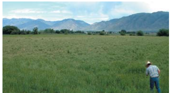
Fig. 6. Cereal leaf beetle crop damage. 4