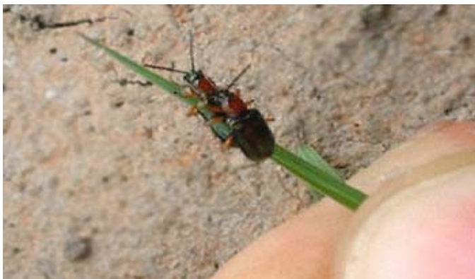
Fig. 3. Mating cereal leaf beetle adults. 4

Pupae: Rarely seen, cereal leaf beetle pupae are encased in earthen cells under the soil surface. The pupae are yellow and look similar to the adults except for poorly developed wings.