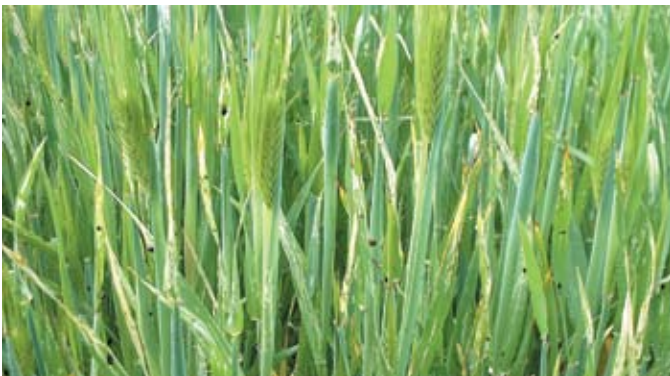
Fig. 7. Cereal leaf beetle larval infestation. 4

Economic damage to small grains is caused by the cereal leaf beetle larvae feeding on the leaves. Typical feeding can result in transparent slits in the leaf blade, and heavy feeding can cause the entire leaf to turn white (Figs. 4, 7). Larvae remove the leaf chlorophyll down to the cuticle and between the veins. Damage is especially noticeable during the flag leaf stage where an entire field can look "frosted" (Fig. 6). Wheat and oat fields are the most susceptible to larval feeding, and yields can be reduced by 30-50% if left untreated. Adults feed on leaves but rarely cause economic damage.