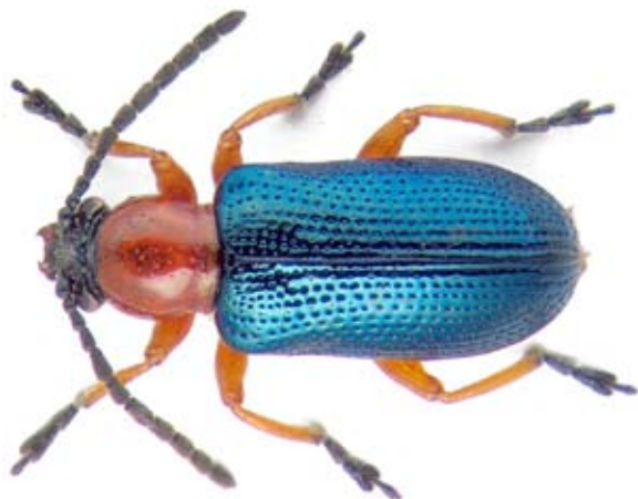
Fig. 1. Cereal leaf beetle adult. 1

Cereal leaf beetle, Oulema melanopus , is a leaf beetle in the family Chrysomelidae (Fig. 1). These beetles are native to Europe and have been considered pests of small grains since 1737. In 1962, cereal leaf beetle was first detected in the United States in a Michigan grain field. Since the 1960s, this insect has spread throughout much of the United States and Canada; now at least 30 states have confirmed cereal leaf beetle populations. Eventually cereal leaf beetles were discovered in Morgan County, Utah, in 1984. Since the first detection, beetles have been confirmed in 16 counties, although only considered established in Box Elder, Cache and Weber counties (Fig. 2). The slow spread and establishment of cereal leaf beetle will no doubt continue to all grain-growing regions in Utah. Most damage, however, is likely to occur in irrigated fields in cooler, moister parts of the state.