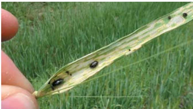
Fig. 4. Cereal leaf beetle larva. 4