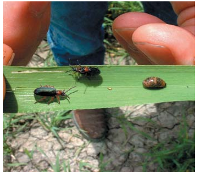
Fig. 5. Life stages of cereal leaf beetle. 4

Cereal leaf beetles have one generation per year and overwinter as adults. In the spring, adults will seek out newly seeded fields of small grains to feed and mate. Temperatures above 66°F are ideal for flight and mating. Females deposit up to 300 eggs on the topsides of leaves. Eggs hatch in 4-23 days depending on spring temperatures. In Utah, the first egg hatch is expected the first week of May and peak egg hatch is during the last week of May. Newly hatched larvae begin feeding on the upper leaf surface. Larvae feed and grow for about 12-20 days while going through four instars. Larvae drop to the ground and burrow into the soil to pupate. Adults emerge from the pupal cases in about 10-21 days. The total development time from egg to adult is about 6 weeks depending on food quality and temperature. Adults will feed on various plants for about 14 days before finding overwintering shelter. Adults can be found in hollowed-out grass stems or other plant debris, under bark, or in building structures.