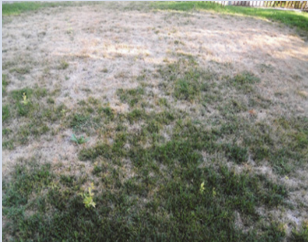
Figure 5. Severe chinch bug damage may lead to complete loss of turfgrass.

Chinch bugs and their damage generally occur in scattered patches in turfgrass. Populations may reach 200 to 300 bugs per square feet in heavily infested, sunny areas. Damage is typically visible from late June through August when the older summer generation nymphs and adults are feeding (Niemczyk and Shetlar, 2000). Damage may be seen earlier in southern Utah.