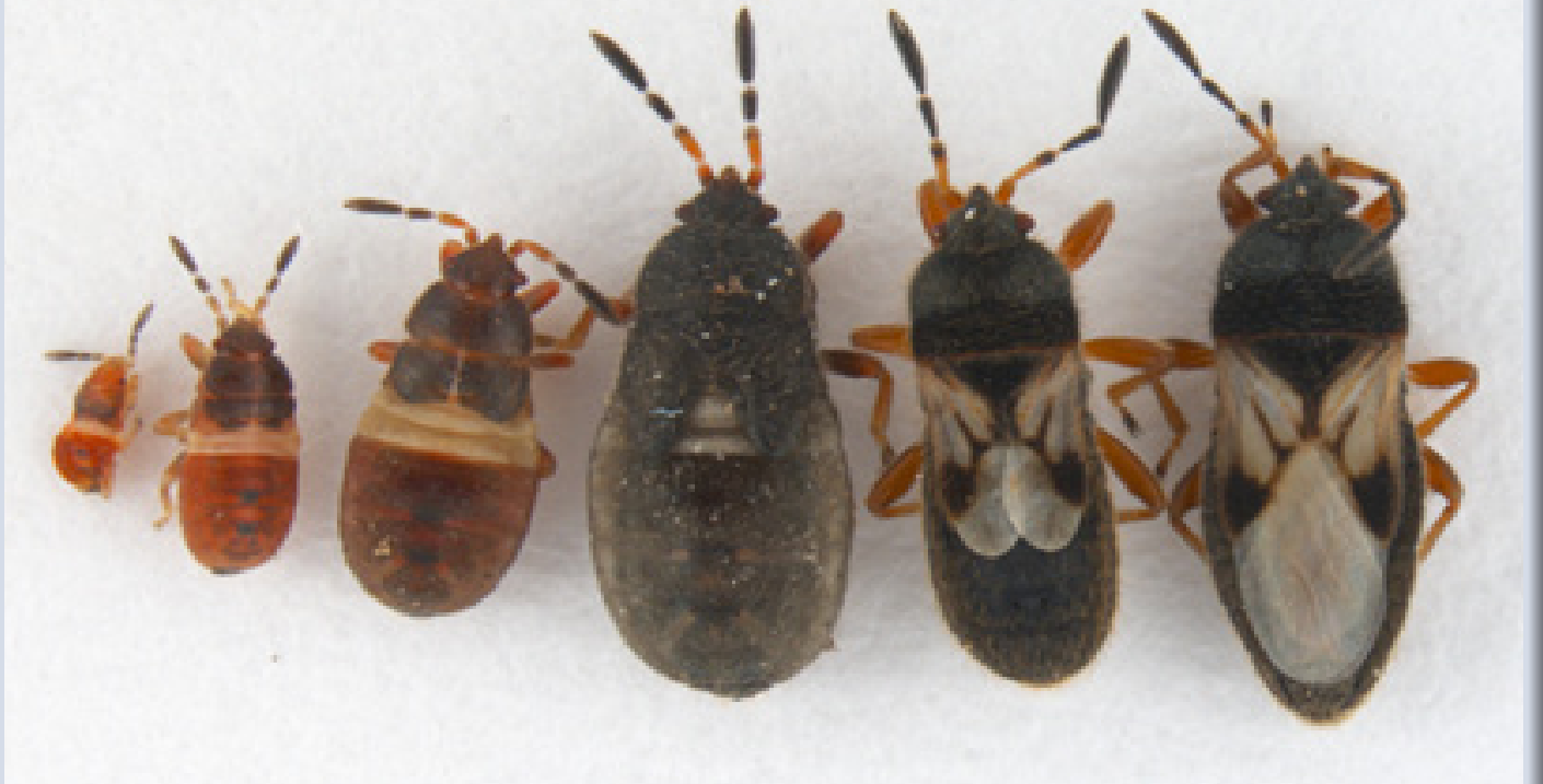
Figure 2. Immature (nymph) and adult chinch bugs.