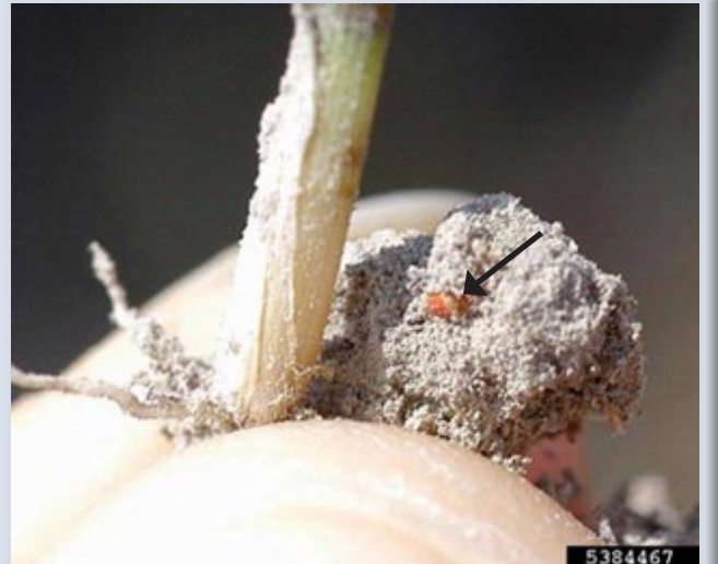
Figure 6. Chinch bug nymphs are very small and easily overlooked.

The simplest method for detecting and monitoring chinch bugs is the “hands and knees” method. Using your thumbs and fingers, pull back grass stems to expose the crowns and thatch where chinch bug adults and nymphs may be hiding. The nymphs are very tiny, however, and may be easily overlooked (Fig. 6). As conditions become warm and drier, chinch bugs may move deeper in the thatch. Because they are so small, a hand lens or magnifying glass may be needed to see them. Visual observation of driveways and sidewalks adjacent to damaged turf areas on hot afternoons often reveals adult chinch bugs running across the pavement. Adult chinch bugs may also be observed crawling on the sides of light-colored buildings under these conditions. Chinch bugs should not be confused with similar looking, beneficial insects like minute pirate bugs and big-eyed bugs (Figs. 3 & 4).