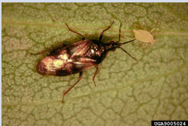
Figures 3 & 4. Chinch bug look-alikes. Big-eyed bug (top); minute pirate bug (bottom). Both insects are beneficial predators.

("shoulders"), pointing toward the rear. Some populations of adult chinch bug have reduced-sized wings as adults. When crushed, chinch bugs emit a foul odor like stink bugs (Vittum et al., 1999).