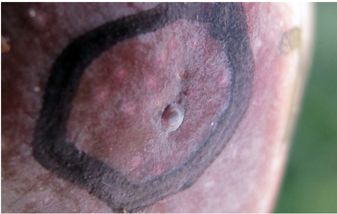
Figure 2. Circled codling moth egg on surface of apple. the black head of the larva is visible