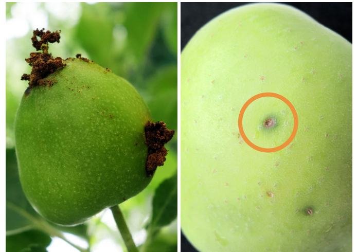
Figure 5. An "entry" (left), is indicated by copious frass (excrement) pushed out by a larva feeding inside the fruit. A "sting" (circled on right), is a healed wound from a larva feeding only on the fruit surface.