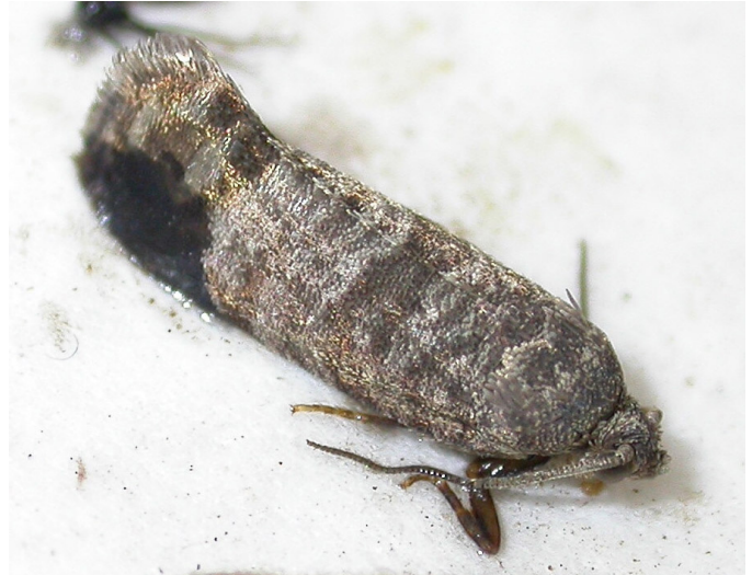
Figure 1. Codling moth adult shown on a trap sticky liner.

Codling moth ( Cydia pomonella ; Order Lepidoptera, Family Tortricidae) is the most serious pest of apple and pear worldwide. In most of Utah, fruit must be protected season-long to harvest a quality crop. Insecticides are the main control tactic, with both organic and conventional options available. For commercial orchards with more than 10 acres of contiguous apple and/or pear trees, mating disruption, a certified organic practice, can greatly reduce codling moth populations to allow reduced insecticide use (see the USU Fact Sheet, " Codling Moth Mating Disruption "). Natural biological control does not effectively reduce populations because newly hatched codling moth larvae enter fruit immediately, protecting them from predators. Sanitation and other cultural methods can help reduce codling moth densities, but alone usually do not provide satisfactory control.