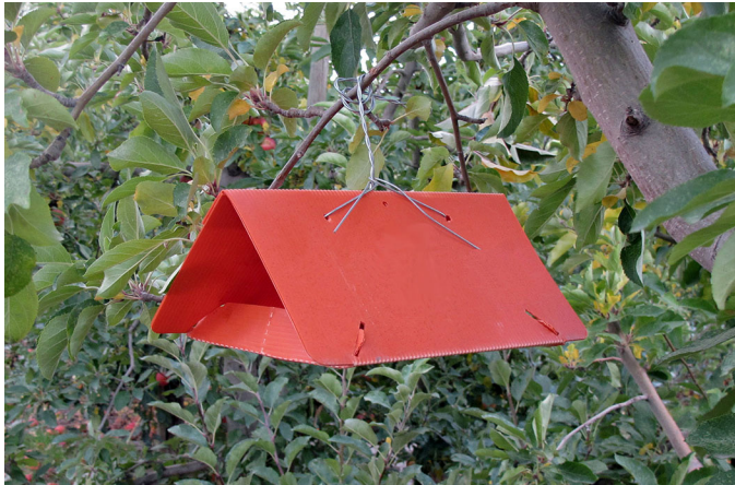
Figure 6. Monitoring with pheromone traps is important to determine moth activity and population size. The recommended trap is the “large plastic delta trap.”