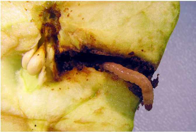
Figure 3. Codling moth larva and tunnel in fruit flesh.