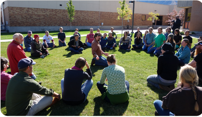
Participants in USU Extension's Permaculture Workshop observe the surrounding environment interacting with the campus's future permaculture garden site. This includes the watershed, wind strength and direction, seasons, sun cycle and more.