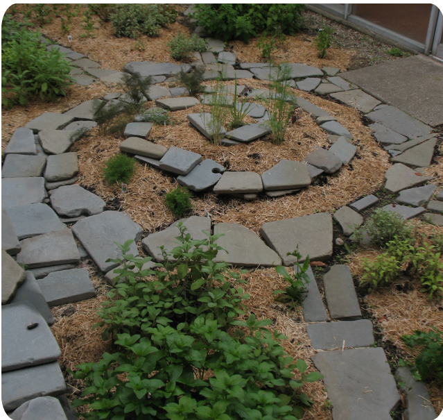
University of Massachusetts' campus permaculture garden also features an herb spiral. This serves as a space organizer, visual attraction and walkway for the campus garden - stacking functions!

Herb spirals are compact vertical gardens allowing for individualized management of wind and water flow. Use a solid material, such as rocks or used bricks, to build the spiral frame. Ensure the center of the spiral is the highest point. Plant herbs that thrive in dryer soils and full sun at the top and use the various angles and heights to plan where to plant herbs depending on their sun and water dependence. The stone or brick walls provide heat retention, insulating the plant roots from cold snaps. Herb spirals can also be built as swales that indent into the ground. Remember, in the northern hemisphere, water runs off in a clockwise direction, so be sure to build your spiral in this same manner to work with the natural flow of water.