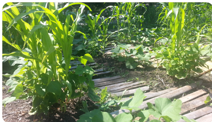
A Three Sisters Garden at the UMass Amherst Campus, Massachusetts - part of the University's Permaculture Initiative ( www.UMassPermaculture.com )

A great example of stacking functions can be taken from the Native American tradition of a Three Sisters Garden of corn, beans and squash. Corn provides a natural pole for beans, beans fix nitrogen in the soil that other plants use, and squash provides a natural ground cover to reduce weeds, retain soil moisture, to serve as a natural mulch, and the prickly hairs help deter pests. The result is known as “overyielding,” where the combined yield of all three crops grown together on the same land is generally higher than what any one of the crops could produce in the same area of land if planted alone (Nabhan, 2013). Lastly, the three sisters also nutritionally complement each other. Beans are rich in protein, balancing a lack of needed amino acids found in corn; corn provides carbohydrates; and squash yields vitamins from the fruit and oil from the seeds.