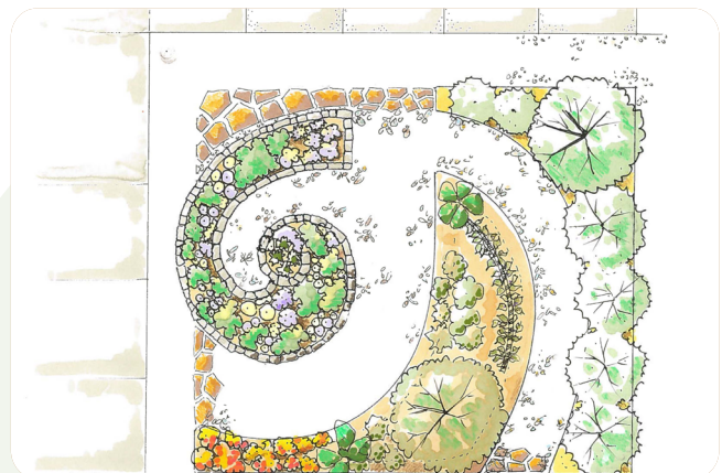
Designing a permaculture site at USU following an observation of the biological and social patterns interacting with the site.