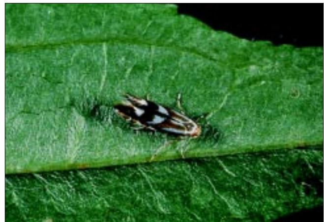
Adult moths are tiny ( \frac{1}{8} - \frac{1}{5} inch long), and can be found resting on leaves and flying in the orchard.