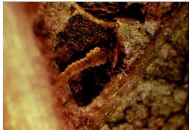
Sap-feeding larva inside mine.

In Utah, the leafminer typically has three generations per year but may have as many as four in some years. The immature larval stages—sap feeders and tissue feeders—feed on apple and cherry leaves. When densities are high enough, feeding can cause a reduction in fruit size and quality.