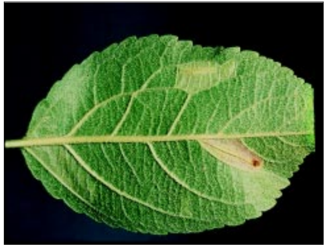
Underside of apple leaf showing mines of the western tentiform leafminer.