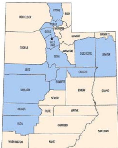
Fig. 1. Western corn rootworm in Utah corn. 1

Western corn rootworm, Diabrotica virgifera virgifera , is one of the most devastating corn insect pests in the United States. In some years, corn rootworms can cause up to $1 billion in yield loss and control costs. In Utah, western corn rootworm has been detected in at least 13 counties (Fig. 1), but likely can be found throughout the state wherever corn is grown. Western corn rootworms are native to North America and were considered minor corn pests until continuous corn production was implemented in the Midwest about 50 years ago. Without a non-host crop rotation, corn rootworms are able to build to damaging levels and cause severe yield loss. Today, nearly all continuous corn is treated with soil insecticides.