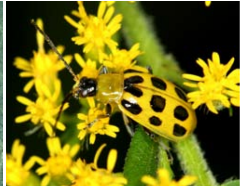
Fig. 9. Southern corn rootworm, or spotted cucumber beetle. 6