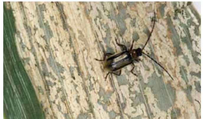
Fig. 4. Western corn rootworm adult feeding scars on corn leaves. 2

Western corn rootworm females are strongly attracted to corn to lay eggs. Females prefer moist soil between the rows in irrigated corn or heavier soil with organic matter >1.5%. Although adults will feed on corn leaves and silks (Fig. 4), economic damage from adults is rare. More often adults will clip corn silks before pollination, which can result in poorly filled ears.