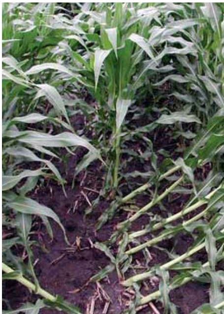
Fig. 6. Corn stalk lodging or goosenecking from heavy corn rootworm damage. 2

Sticky card traps: Sampling whole plants for adult corn rootworm is the most accurate way to predict larval damage the following year. But sticky cards can