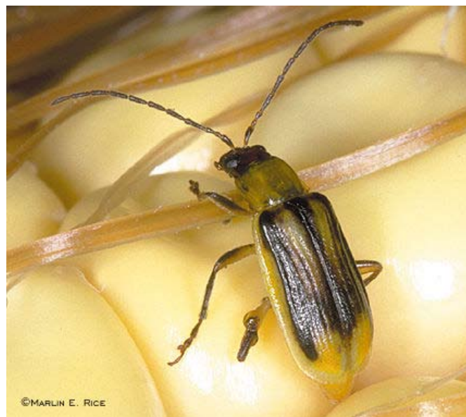
Fig. 2. Adult western corn rootworm. 2