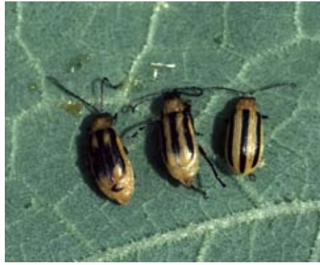
Fig. 8. Western corn rootworm and striped cucumber beetle (right). 5