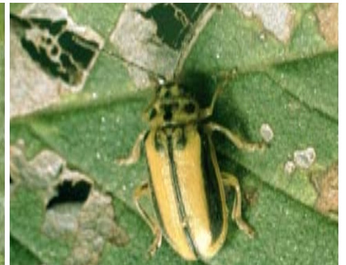
Fig. 12. Elm leaf beetle. 7