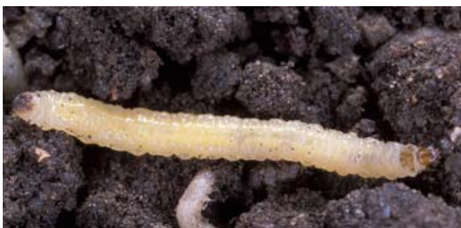
Fig. 3. Western corn rootworm larva. 3