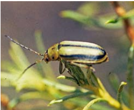
Fig. 10. Rabbitbrush beetle. 5