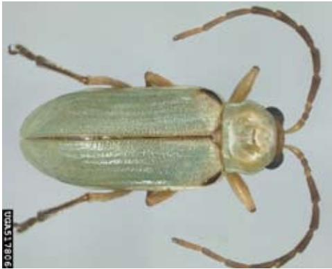
Fig. 7. Northern corn rootworm. 4

Western corn rootworm is closely related to other leaf beetles in the family Chrysomelidae (Figs. 7-12). Other leaf beetles can look similar to western corn rootworm with slight color variation on the wings and head (Figs. 10-12). In some parts of the United States, three rootworm species (i.e., northern, western and southern) can be feeding in corn at one time. In Utah, the western corn rootworm is the most economically important species. When distinguishing western corn rootworm from other leaf beetles, notice the three black stripes on the forewing do not always extend to tips and can sometimes “bleed” together (Figs. 2, 8).