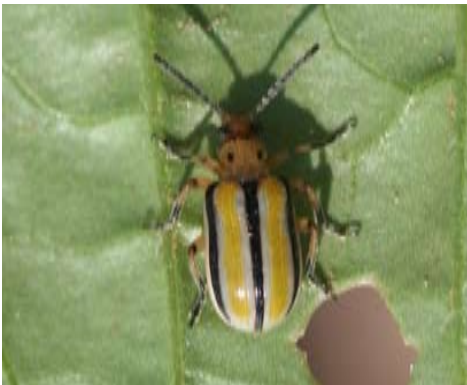
Fig. 11. Threelined potato beetle. 5