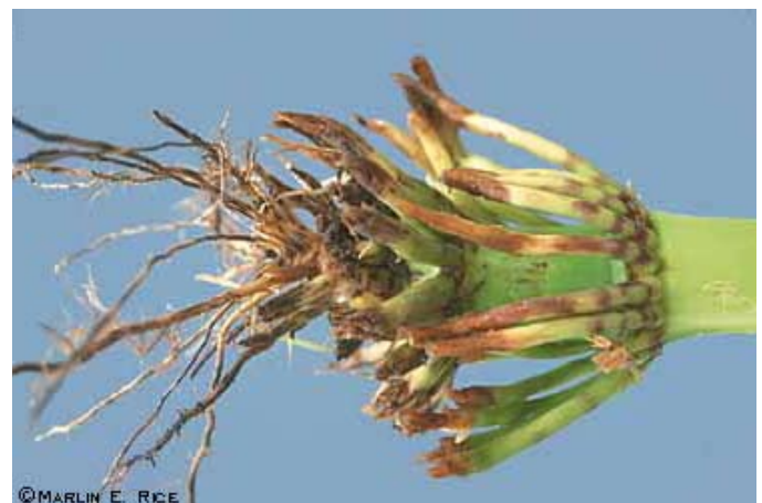
Fig. 5. Heavy corn rootworm damage. Notice the primary and secondary roots are missing or turning brown from larvae tunneling inside while feeding. 2