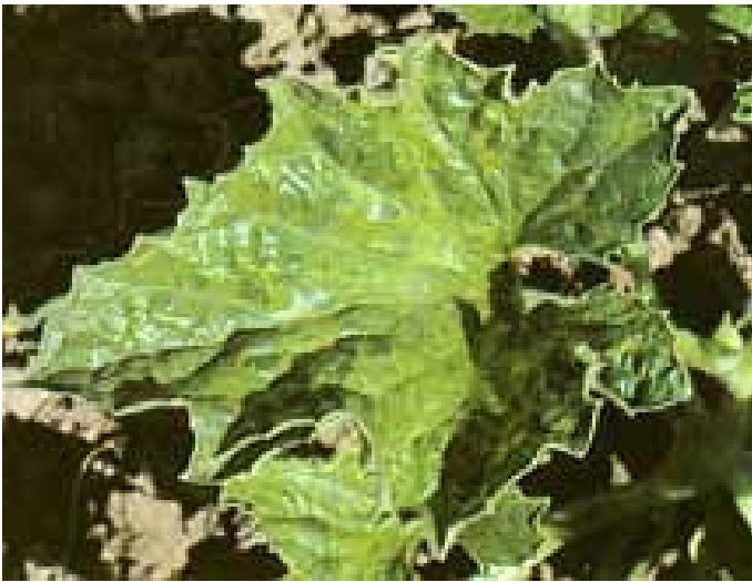
Fig. 8. Squash mosaic virus symptoms on squash leaf. 8