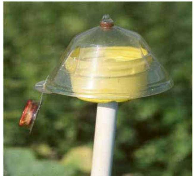
Fig. 9. Trécé cucumber beetle trap. 9

crop before the main crop is attractive. Varieties of the following cucurbits have been shown to be highly attractive to cucumber beetles: zucchini ('President', 'Black Jack', 'Green Eclipse', Seneca Zucchini', 'Senator', 'Super Select', 'Dark Green Zucchini', and 'Embassy Dark Green Zucchini'), summer squash ('Cocozelle' and 'Caserta'), buttercup squash ('Ambercup'), melon ('Classic'), and pumpkin ('Big Max' and 'Baby Poo') (Bellows and Diver 2002). Treat the trap crop with insecticides before adults lay eggs.