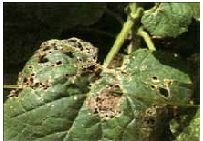
Fig. 7. Striped cucumber beetle adults and feeding injury to cucurbit leaves. 7

Striped cucumber beetle adults and larvae feed on cucurbit fruits. Smooth-skinned cucurbits such as watermelon, honeydew, crenshaw and casaba are especially sensitive to injury. Beetles prefer to feed on soft rinds before fruits mature; injury can be worse on the undersides of fruits (Figs. 3 and 4). Striped cucumber beetle larvae feed on cucurbit roots and can stunt and kill plants reducing plant stands. Adults will also chew holes in leaves (Fig. 7) and stems and can destroy flowers. Injured stems will break during high winds reducing plant stands and runners. Spotted cucumber beetle is a less severe pest of cucurbits. Larvae do not feed on cucurbit roots while adults will feed on cucurbit leaves, and sometimes on soft fruits (Table 1).