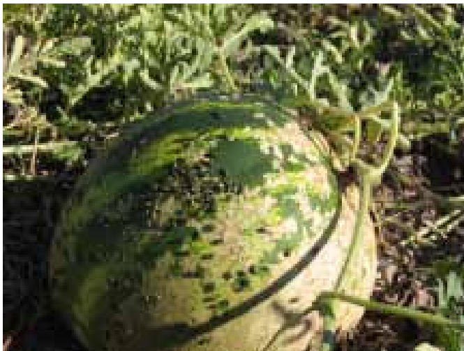
Fig. 3. Striped cucumber beetle adults scar rinds of watermelon. 3