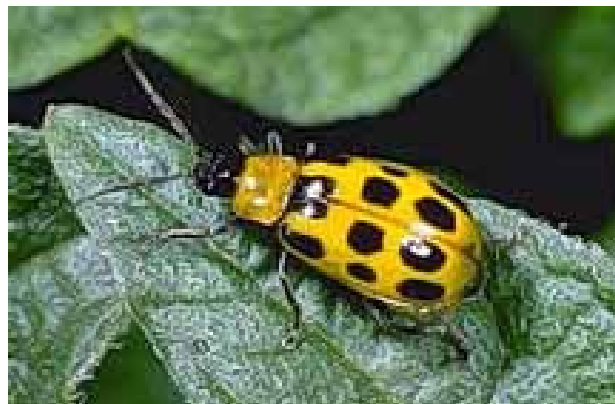
Fig. 2. Spotted cucumber beetle adult. 2