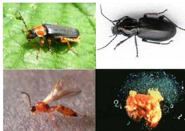
Fig. 10. Natural enemies of cucumber beetles (clockwise from top left): soldier beetle, ground beetle, entomopathogenic nematodes emerging from a beetle larva, and braconid wasp. 10

Natural predators and parasitoids that attack cucumber beetles in Utah include ground beetles, soldier beetles, braconid wasps, tachinid flies, and entomopathogenic nematodes (Fig. 10). Nematodes can suppress cucumber beetle larvae and pupae in the soil while the others will attack adults, eggs and larvae on plants or on the soil surface. Natural populations of these beneficial agents can be preserved by avoiding the use of broad-spectrum, toxic insecticides and enhancing crop and soil health through cultural practices. Purchase and release of natural enemies from commercial suppliers has not proven effective for cucumber beetles.