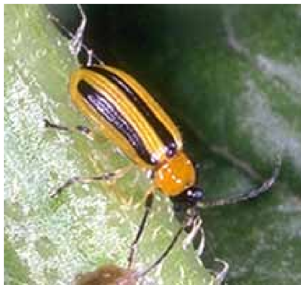
Fig. 1. Striped cucumber beetle adult. 1