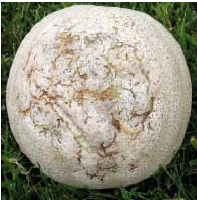
Fig. 4. Striped cucumber beetle larvae tunnel into rinds and flesh of cantaloupe. 4