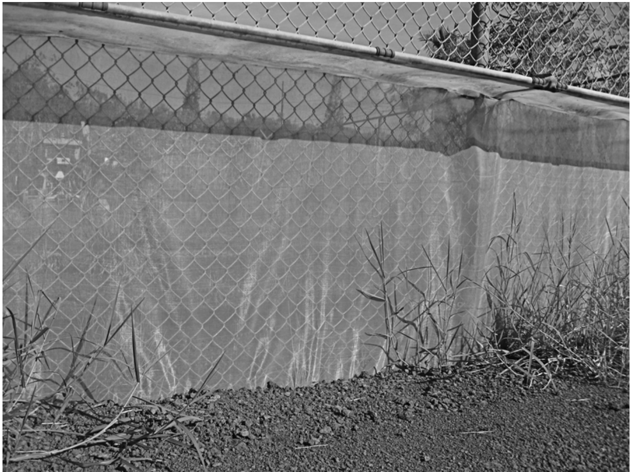
Figure 4. Photograph of a fine mesh frog barrier attached to chain link fence. The frog barrier is 1 m high with the bottom apron buried under gravel and an upper lip extending 25 cm out from the barrier at a 90° angle.