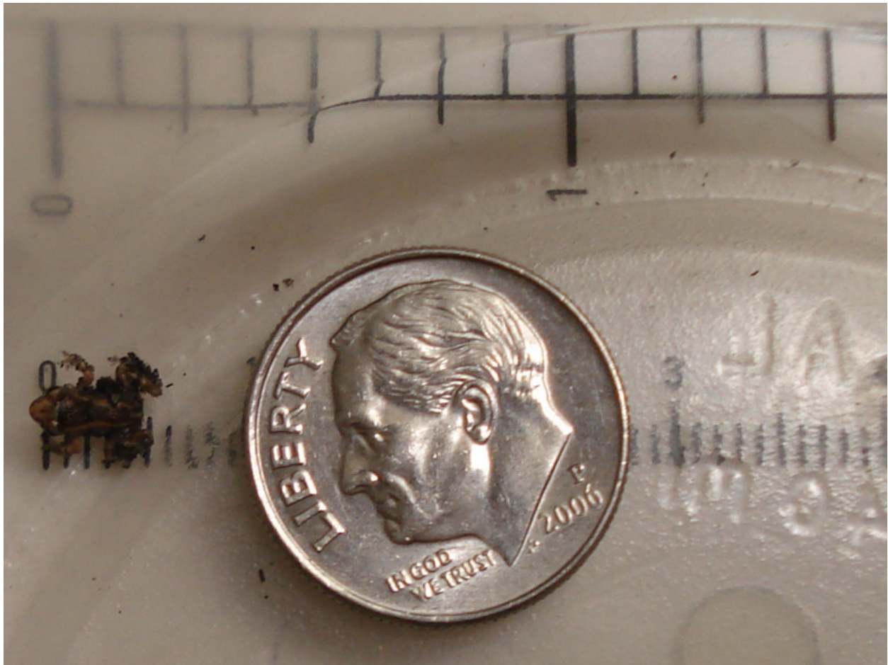
Figure 2. Photograph of a recently hatched juvenile from Florida (Sarasota County) showing size and striped color phase.