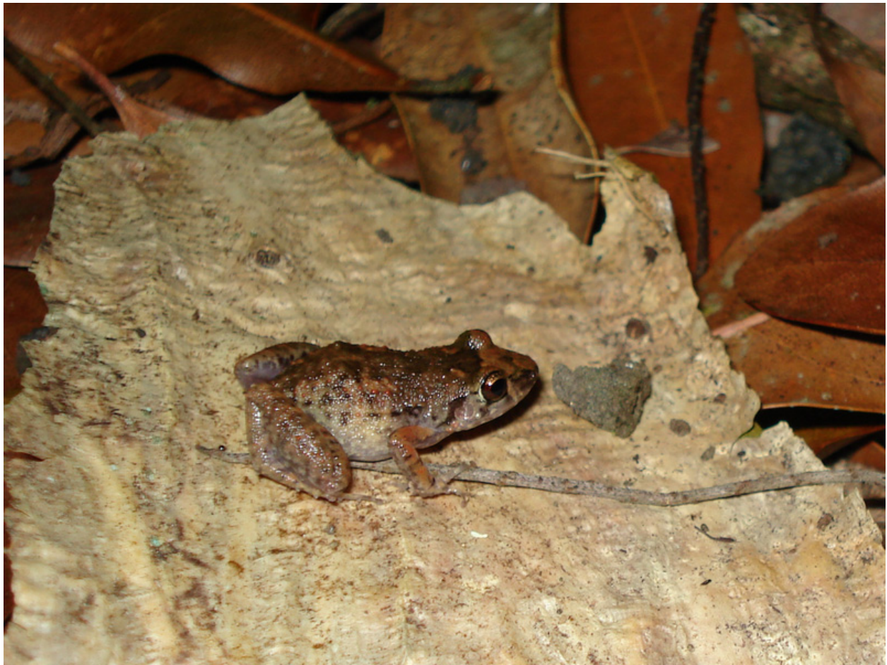
Figure 1. Photograph of adult female taken in Hawaii showing mottled color phase.