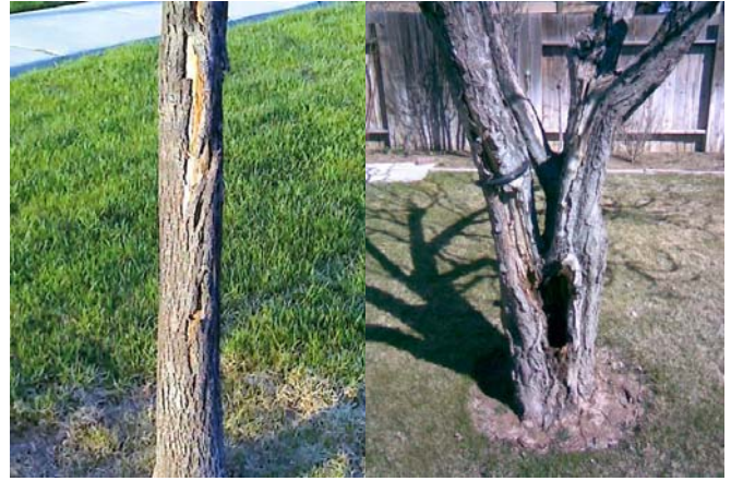
Examples of southwest winter injury.

fruit produced and annual new growth. If these are all satisfactory, do not fertilize. Younger trees should grow between 12 to 15 inches annually. Older trees growth (planted longer than seven years) should be between 8 to 12 inches annually. In dwarf trees, as little as 4 to 6 inches of growth per year is acceptable.