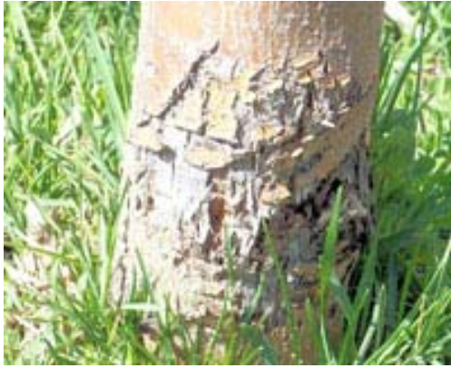
When turf is not removed, damage occurs from string trimmers and mowers that stress and cause trees to be excessively prone to pests and diseases.