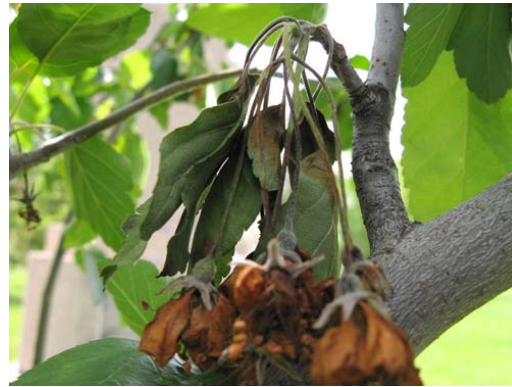
A newly infected branch with fire blight.

purchasing from local vendors and box stores. Some mail order catalogs list what rootstock the tree has been grafted onto or may even list more than one rootstock choice that may be ordered. With some research, this information can be useful for choosing rootstocks with desired characteristics. For further information concerning fire blight, access the following factsheet: http://extension.usu.edu/files/publications/factsheet/fire-blight-08.pdf . Information concerning varietal fire blight resistance can be found by variety in Table 1. Rootstocks with Geneva (or an abbreviation of the letter G) in the name are additionally resistant, but availability is limited. For more rootstock information see Table 3.