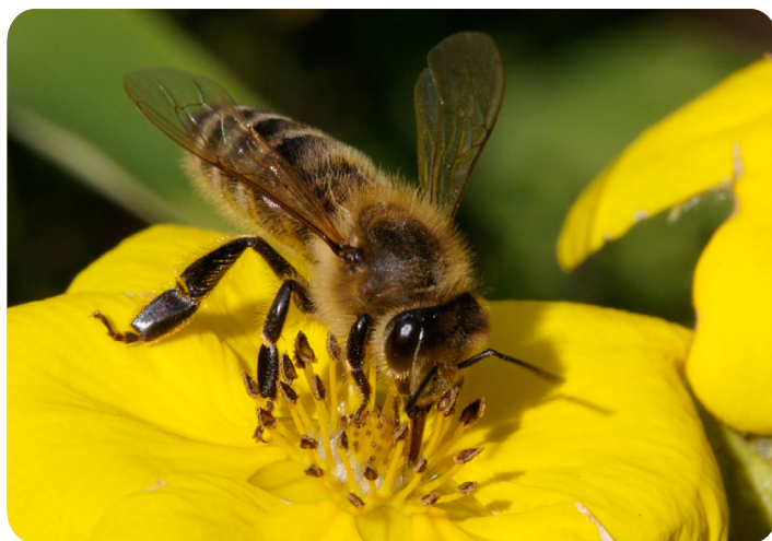
Honeybee pollination is a critical piece of the food chain.

Be sure to research and understand local laws, ordinances, and regulations regarding beekeeping in a residential setting. In some instances, you may have to obtain permits. Depending on where you want to place your hives, it may be wise to check with your