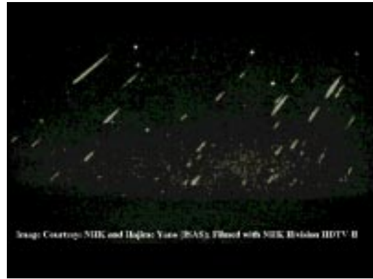
Figure 2: One-minute composite image of the 1999 Leonid meteor shower peak ( < 5 th mag.) over Europe, imaged with the HDTV-II in 59 \times 33 degrees FOV developed by NHK (from Yano et al., [2])

Even flying high in the sky, say 10km altitude, the observation has to be made through the dense of the atmosphere, which brings disadvantage in the ultra-violet (UV) wavelength. If the observation is made from the low Earth orbit, looking down from out of the atmosphere over the night