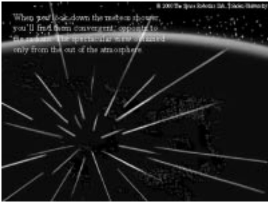
Figure 1: Artist impression of how the Leonids outburst looks from space