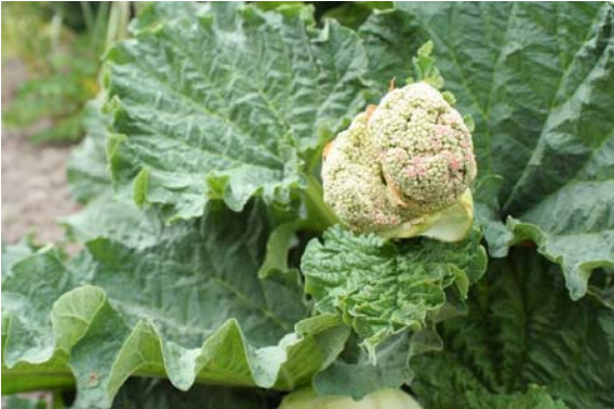
A newly formed rhubarb flower stalk. The tendency to flower is variety dependent 1 .

Flowers: Rhubarb occasionally produces flower stalks. Flowering tends to reduce plant vigor and leaf and petiole production. Flower stalks should be removed just as they begin to elongate.