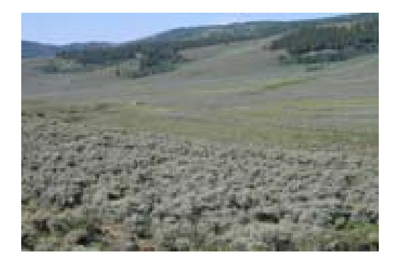
Figure 5. Area treated with Dixie Harrow in 2000.