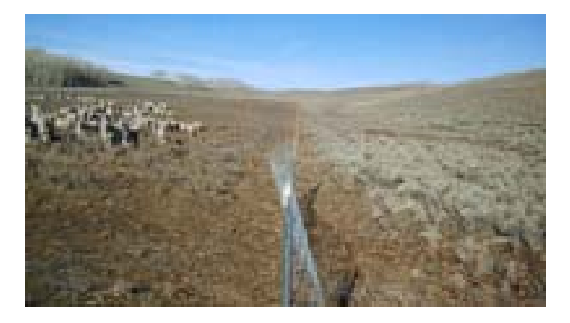
Figure 3. Grazed plot (left) and ungrazed plot (right), Parker Mountain Study Site, 2006.

Amount funded over 3 years: $141,124 Status: On-going