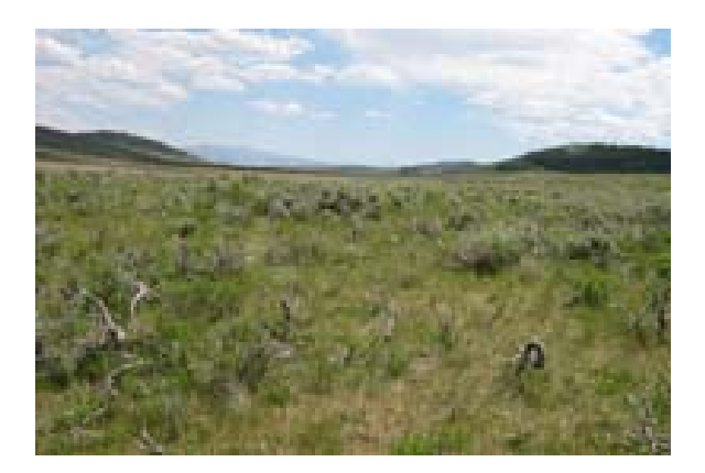
Figure 1. Area treated with 2,4-D in 1995.