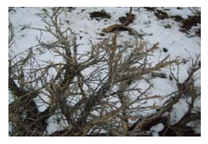
Figure 4. Heavily grazed sagebrush plant, Parker Mountain Study Site, 2006.