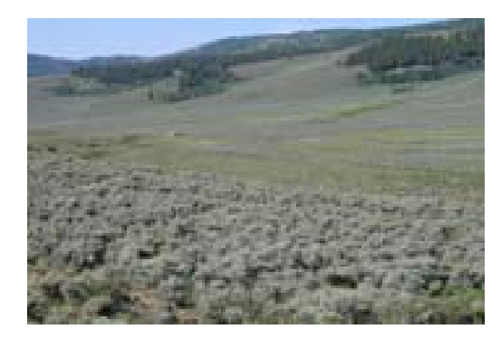
Figure 7. Daubenmire quadrats measure herbaceous cover