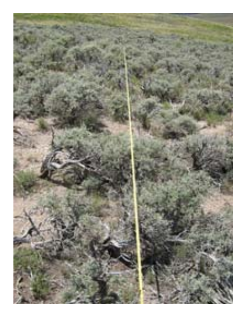
Figure 6. Line-intercept method measures shrub canopy cover.