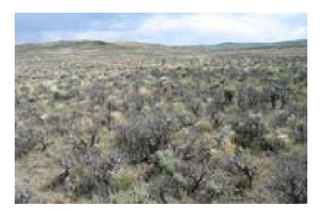
Figure 2. Area treated with Spike in 1994.