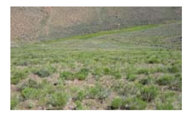
Figure 3. Area treated with fire in 2000.