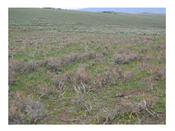
Figure 5. Sagebrush plot (center of photograph) in the spring, Parker Mountain Study Site, 2007.

Figure 3. Grazed plot (left) and ungrazed plot (right), Parker Mountain Study Site, 2006.