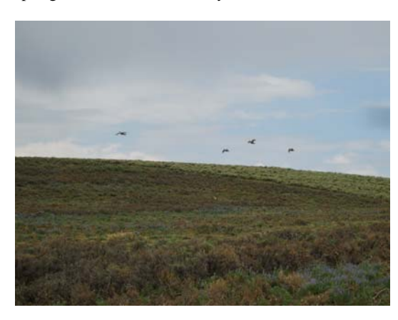
Figure 6. Greater sage-grouse brood flushing from a grazed sagebrush plot (center of photograph), Parker Mountain Study site, 2007