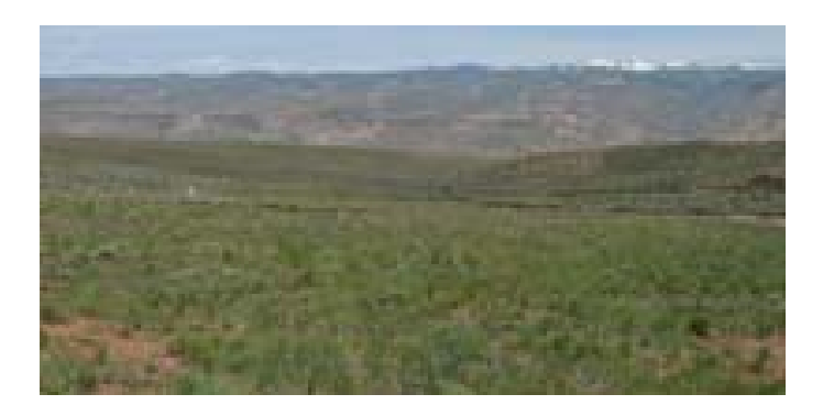
Figure 4. Area treated by brushmowing in 2003.