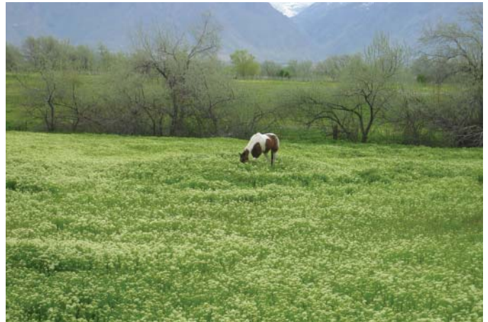
Large infestation of hoary cress

most successfully through sprouting from extensive root systems. It is most commonly spread through waterways and along roads from human activity. Like most noxious weeds, hoary cress is unpalatable to most animals, especially after flowers have bloomed. Hoary cress is shade intolerant and prefers moist soils in irrigated meadows, roadsides and other disturbed sites.