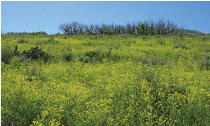
Leafy spurge can become quickly established in undisturbed areas.

Reproduction of leafy spurge will occur vigorously from both roots and numerous seed heads. Roots have been found to grow more than 10 feet vertically and horizontally, any part of which can regenerate a new plant. Seeds are enclosed in capsules which ultimately burst and disperse up to 15 feet in all directions. Most seeds will germinate within a year; however, they may last in the soil for up to 8 years. Seeds also float easily and therefore spread rapidly by water. Leafy spurge will colonize and reproduce on nearly all sites but prefers dry sites with a coarse soil; even heavily shaded woodlands are prone to infestation. Invasion into undisturbed areas is not uncommon, making it difficult to protect the land from new invasions.