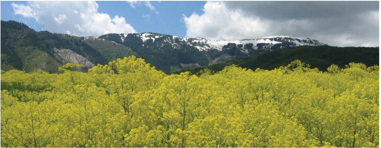
Many areas like this have been completely taken over by weeds such as dyer's woad.

The table below summarizes available control methods for the weeds outlined in this fact sheet.