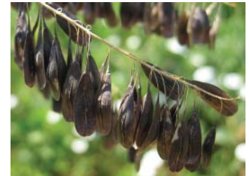
dyer's woad seeds

sites are usually the first sites to become occupied, but rangelands and wooded areas are quickly invaded. Dyer's woad also releases chemicals that inhibit the germination of other plants, giving it an extra advantage over native plants. Dry, rocky areas are most favored by this plant, often making it a difficult weed to control.