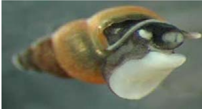
Alias: New Zealand Mudsnail

Why unwanted: The New Zealand Mudsnail outcompetes native invertebrates for food and space because its population densities exceed 100,000 individuals per square meter. The Mudsnail can consume up to 75% of the gross primary production. This species has recently been seen biofouling, or accumulating in overwhelming numbers, in wetland areas.