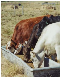
Figure 16. Cattle consuming free choice mineral mix

Free choice feeding of minerals is probably the easiest and most wide-spread practice of supplying minerals; however, with this method of supplementation, wide variation of intake can exist. Free choice intake is dependent on several factors: palatability of the mineral preparation, water quality and hardness, mineral content of the feeds, types of feeds, physical location of the mineral and individual animal preferences.