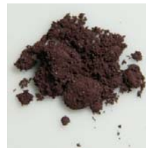
Figure 2. Red phosphorus

Phosphorus works in combination with calcium in the formation of bone. Grains are considered a good source and forages are a subsidiary supplier of phosphorus. Because of their mutual role in bone metabolism, calcium supplementation and phosphorus supplementation are usually considered at the same time. The recommended calcium-to-phosphorus ratio in ruminant diets is 2:1 to 1.2:1. Significant deviation from this ratio can result in abnormal bone growth and a condition known as water-belly (Hale and Olson, 2001). Phosphorus deficiency can result in low conception rates, reduced feed intake, poor feed efficiency, lower growth rate, reduced milk production, reproductive failures and skeletal abnormalities. A common symptom of phosphorus deficiency is often seen as the unusual habit of an animal eating or chewing foreign substances such as dirt or wood. Since the body pool of phosphorus is low, phosphorus deficiencies of this mineral are very quickly expressed physiologically. A Vitamin D deficiency or an excess in dietary calcium will reduce the absorption of phosphorus.