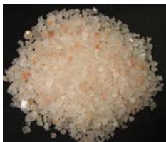
Figure 6. Granulated salt

The requirement for sodium and chlorine is commonly expressed as a salt requirement. Both sodium and chlorine function to regulate body pH and the amount of water retained in the body (Lawton, 2013). Sodium is involved in muscle and nerve function. Chlorine is essential for hydrochloric acid production in the abomasum and for carbon dioxide