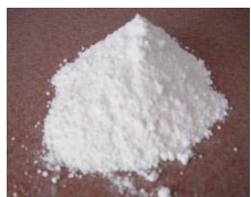
Figure 1. Calcium

Calcium is necessary for the formation and maintenance of bones and teeth, development of enzymes, hormones and muscle. Calcium requirements change depending on animal age and production status. Forages are usually good sources of calcium, while cereals are at best a marginal