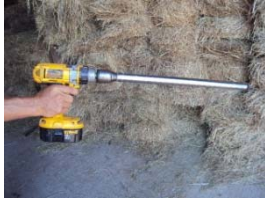
Figure 14. Feed core sampler

Minerals have been deposited in soils over countless years. The amounts and types of each mineral found in Utah soils will vary considerably. The amount of mineral contained in a sample of forage is dictated to a large degree by the concentration of the mineral that was available in the soil as it grew. There is usually a direct correlation between the mineral concentration in the soil and plant material that is grown in that soil (ZoBell, 2000).