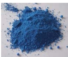
Figure 12. Cobalt blue

Cobalt is required for synthesis of vitamin B12. Since vitamin B12 synthesis occurs in the rumen, cobalt must be consumed in the diet. Deficiency symptoms for cobalt include loss of appetite in the early stages of deficiency, followed by muscle wasting and