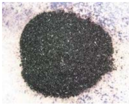
Figure 11. Iodine crystals

Iodine is essential for production of thyroxin, a hormone