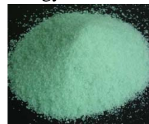
Figure 4. Iron sulfate

Iron functions in oxidative enzyme systems involved in energy metabolism. It also enables the hemoglobin in red blood cells to carry oxygen to the tissues of the body. Milk is low in iron, so young animals are likely to have “nutritional anemia” from a deficiency of iron caused by an exclusive milk diet; however, iron deficiency is rarely seen in calves raised in a pasture setting (Hale and Olsen, 2001). Other iron deficiency symptoms include reduced feed intake and pale mucus membranes. A deficiency of iron is not likely to occur with adult cattle that have been provided with reasonable parasite control.