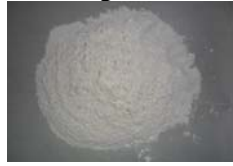
Figure 3. Magnesium oxide

Magnesium is an activator of many metabolic enzymes. Since high levels of calcium and phosphorus intake may decrease the accessibility of dietary magnesium, care should be taken to correct any deficiencies resulting from this problem. Grass Tetany is a magnesium deficiency occurring when animals graze flourishing green pasture. This disease is expressed by nervous twitching