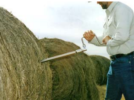
Figure 15. Core sampling of a round bale

The concentration of a given mineral in a sample of plant material can be determined in a laboratory. Laboratories are available to perform tests conveniently and economically. A sample of plant material should be tested from every field producing feed for livestock. This should be done every 5 to 7 years since mineral levels will vary depending on the soil type and the application of fertilizer. Feed samples should be taken from the feeds that are being fed to the cattle along with clippings from pastures and sent to the laboratory for analysis. Feed