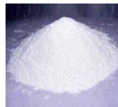
Figure 8. Zinc oxide

Enzymes for protein and carbohydrate metabolism require zinc. The immune system also requires zinc to function correctly. Deficiency symptoms of zinc include failure to grow and gain weight, scabby skin on the legs, slow wound healing, excessive salivation, loss of hair, and dermatitis over the entire body. A deficiency of zinc is not likely to occur under normal feeding conditions; however, high calcium in the diet has been shown to interfere with zinc absorption in the gut.