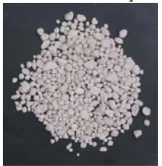
Figure 5. Potassium sulfate

Potassium is everywhere in the body of mammals because it is required in large amounts by most organ systems for normal function. Forages usually have sufficient potassium to meet animal needs; however, cereal grains can be low in this nutrient. Potassium is of major importance in osmotic balance, acid-base balance, and in maintaining body water balance. Growth retardation, unsteady gait, general overall muscle weakness