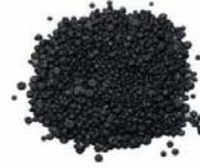
Figure 13. Selenium granules

The potential of selenium deficiency has been widely recognized throughout the U.S.