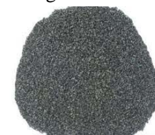
Figure 9. Manganese

Manganese functions as a part of numerous enzyme systems. High levels of dietary calcium and phosphorus may interfere with manganese metabolism, causing the dietary requirement for manganese to increase. Deficiency symptoms include reduced fertility in cows and crooked calf syndrome in