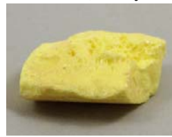
Figure 7. Sulfur

Sulfur is present in protein, certain vitamins (thiamin and biotin), enzymes and other compounds. Excessive sulfur interferes with the metabolism of selenium, copper, molybdenum and thiamin. Sulfur deficiency symptoms include decreased feed intake, unthrifty appearance, drabness of the hair coat and hair loss.