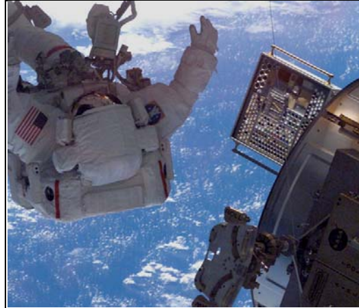
Figure 2. Astronaut deploying MISSE-2 on the International Space Station. [Ref. 1]

the likelihood of deleterious spacecraft charging effects and are essential parameters in modeling. While preliminary ground-based studies have shown that contamination can lead to catastrophic charging effects under certain circumstances, little direct information is presently available on the effects of sample deterioration and contamination on emission properties for materials flown in space. Additional studies of the service life of composite and ceramic materials of the ATK Thermal Protection Systems and Lightweight Structure Systems will evaluate chemical and mechanical properties as a function of depth from the AO and UV exposure surface. Materials will also be tested for the Space Dynamics Laboratory GIFTS satellite. Studies will be conducted of materials for the James Webb Space Telescope heat shield and cryogenic cable harnesses with an emphasis on the changes in resistivity and electron emission properties at cryogenic temperatures. Materials for the heat shield for the NASA Solar Probe Mission, designed to fly within 4 solar radii of the sun on a future science mission, will be evaluated in terms of optical and electron emission properties for survivability in severe radiation, high temperature and cryogenic environments that the spacecraft will experience near the Sun and in a Jupiter flyby. .