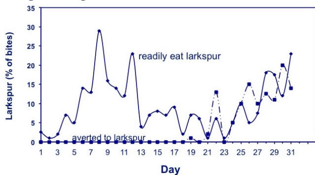
Figure 1. Percentage of bites/day of larkspur take by cattle trained to avoid larkspur and cattle readily ate larkspur. Both groups grazed together on the same rangeland.

In some cases, a toxic plant may be a novel food or livestock have been averted it. If these animals are allowed to graze with animals that readily eat the toxic plant, soon all animals will likely start eating the plant. In a research study (Figure 1), one group of cattle was trained to avoid larkspur by dosing them with lithium chloride soon after eating larkspur for the first time. Lithium chloride causes nausea and food aversions. The other group of cattle did not receive lithium chloride after eating larkspur so they readily ate larkspur. Cattle trained to avoid larkspur, did not eat it for three years. As long as cattle grazed as separate groups, those trained to avoid larkspur took no bites of larkspur, while cattle not averted larkspur took 20% (year 1), 12% (year 2) and 11% (year 3) of their bites from tall larkspur. Finally at the end of the study, the two groups of cattle were mixed and within 21 days all cattle were eating larkspur, including those trained to avoid larkspur (Ralphs and Olson, 1990).