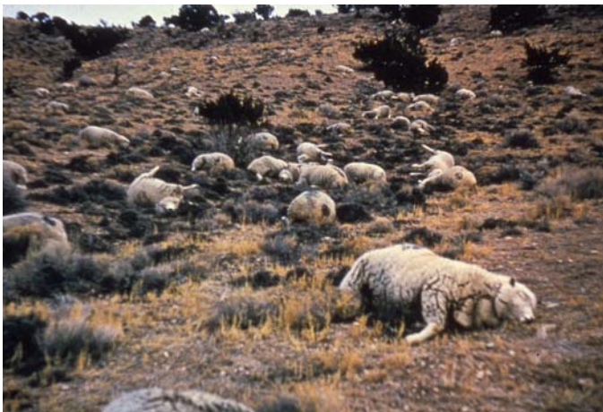
Figure 3. In 1971, 1250 dead sheep scatter the range after they over-ingested halogeton near Garrison, Utah. The availability of livestock water was limited and the range was heavily infested with halogeton. In this case, poor management led to the deaths of these sheep.

Thirsty animals often have no appetite. If high densities of poisonous plants grow near watering points, once thirsty animals drink they may over-ingest poisonous plants while waiting for the rest of the herd or flock to water. Normally, if animals have a choice between eating a toxic food or starving, in most cases they'll eat toxic plants. Animals need to have nutritious alternatives when toxic plants are present. For example in 1971, 1250 sheep from died from over-ingestion of halogeton. Sheep had limited supplies of water and were hungry; as a result sheep ate 10 times the amount of halogeton to cause death (Figure 3) (EPA, 1971). Sheep can incorporate some halogeton in their diet without adverse effects, provided halogeton is added to their diet slowly to let the rumen to adapt