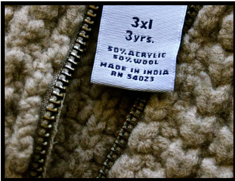
Figure 4: Fiber content label for acrylic blend fabric.