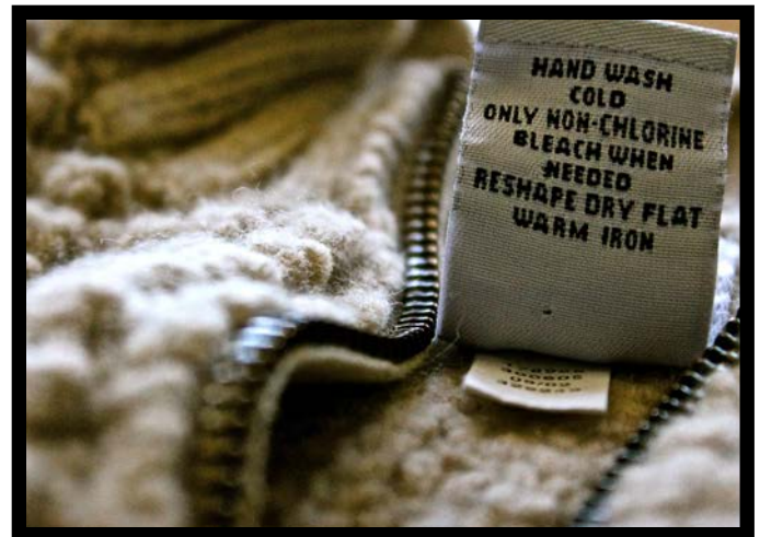
Figure 5: Care label for acrylic blend fabric.