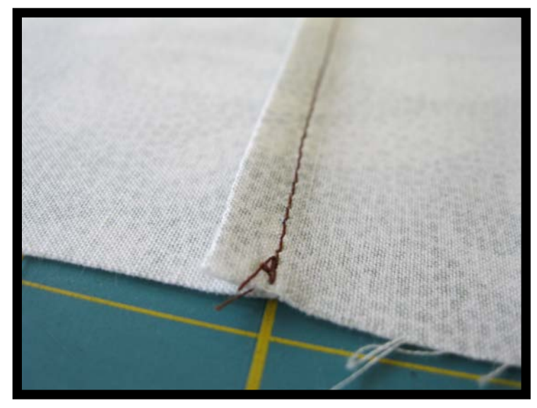
STEP 5: Press seam to one side.