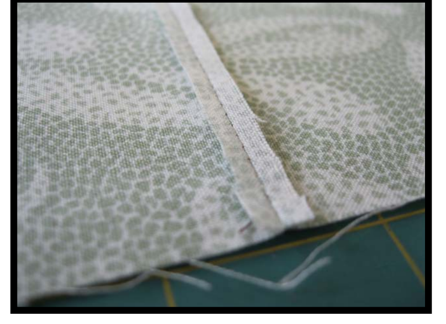
STEP 2: Press seam open.