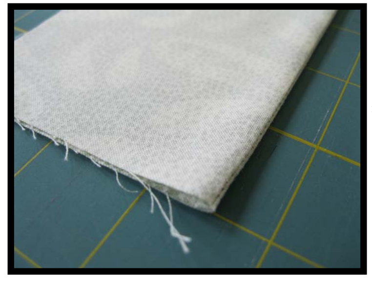
STEP 3: Fold garment along the seam line, right sides of fabric together. Press.

STEP 4: Using a 3/8" seam allowance, stitch a straight stitch along the folded edge of fabric to enclose the seam. Open fabric (see picture to right).