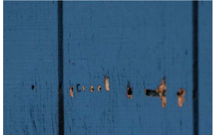
Figure 2. Flicker foraging holes in wood siding.

also drill a hole for a nest cavity. This hole will be roughly the size of the flicker itself. Flickers usually select dead trees that are soft inside to excavate to create a hole. Sometimes, they may be attracted to wood siding or wood shingles on a home as a potential place to build a cavity (Figure 3).