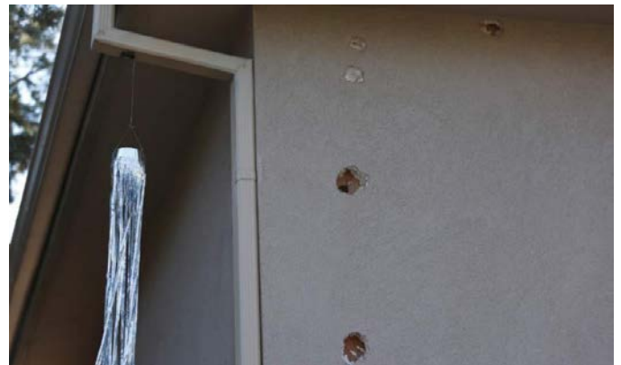
Figure 3. Example of flicker nesting attempts in a home, and Mylar ribbons hung to scare away the bird.