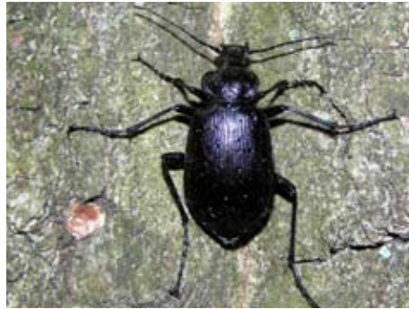
Fig. 5. Ground beetle adult. 5