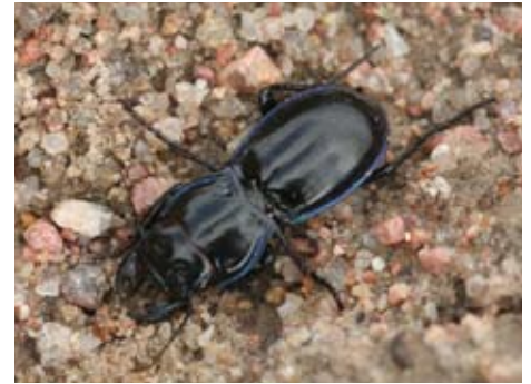
Fig. 6. Ground beetle adult. 6