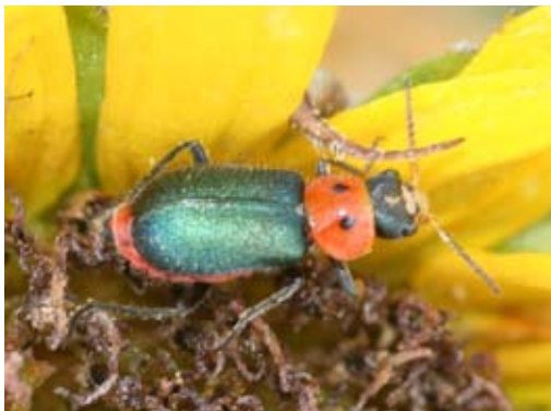
Fig. 14. Two-spotted melyrid adult. 6

Two-spotted melyrid , Collops bipunctatus , is a soft-winged flower beetle in the family Melyridae (Fig. 14). The adult body is widest at the rear and the forewings are relatively soft compared to other beetles. The legs are slender and the antennae are sawtoothed. This beetle has a voracious appetite for aphids. Adults have an orange body with a dark green head and metallic green forewings. The orange "shoulders" have two dark spots.