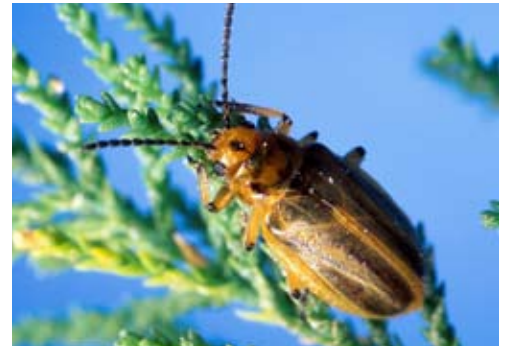
Fig. 15. Saltcedar leaf beetle. 11

Saltcedar leaf beetle , Diorhabda elongata , is a leaf beetle in the family Chrysomelidae (Fig. 15). This beetle is native to China, but was introduced into Utah to control saltcedar, or tamarisk. Adults are 5-7 mm long with alternating black and greenish stripes on the forewings. Both the adults and larvae are beneficial, eating saltcedar vegetation.