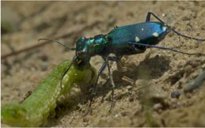
Fig. 10. Six-spotted tiger beetle adult attacking a caterpillar. 8

Another group of predatory insects are the tiger beetles in the family Cicindelidae. There are at least 200 species of tiger beetles in North America and they are closely related to the ground beetles. Adults and larvae are predatory and will consume almost any type of insect. Tiger beetle adults are often brightly colored metallic blue, green, or orange, and range from 10-20 mm in length (Figs. 10, 11). Adults have long legs and are quick runners. Tiger beetles are considered ambush feeders and will seize prey with powerful sickle-like mandibles. The S-shaped larvae construct vertical burrows in dry soil and wait for prey to fall inside. Tiger beetles have one generation per year and commonly hunt during the day in gardens, stream edges, forests and deserts.