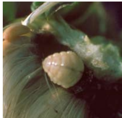
Fig. 16. Thistle-head weevil adult. 6 Fig. 17. Thistle-head weevil larva. 10

Thistle-head weevil , Rhinocyllus conicus , is a weevil in the family Curculionidae (Figs. 16, 17). This beetle is native to Europe, Africa and Asia, but was introduced into North America for biological control of musk (nodding) thistle. Adults are 10-15 mm long and are yellowish brown in color with a pronounced snout. Mated females lay eggs on the bracts of musk thistle flower buds. Larvae are the beneficial life stage, eating the developing thistle seeds.