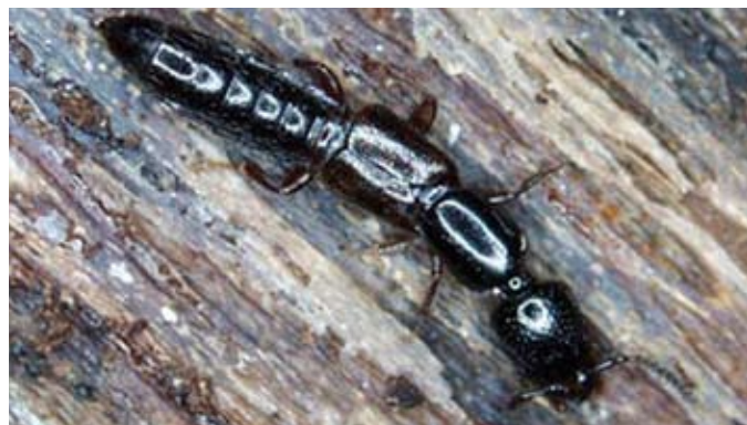
Fig. 2. Rove beetles can be beneficial insects. 2