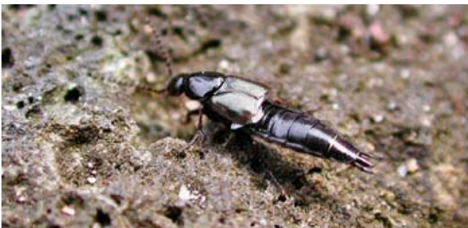
Fig. 7. Rove beetle adult. 7

Rove beetles are another large group of predatory insects. Rove beetles are in the family Staphylinidae and more than 3,000 different species are found in North America. Rove beetle adults and larvae are predators of other insects, but will also eat decaying vegetative matter. The adults are very easily distinguished from other beetles because they have shortened forewings that expose the end of the abdomen (Fig. 7). Although rove beetles can fly, the adults are more often seen running on the ground. Adults are shiny brown or black, have enlarged mandibles for grasping prey, and range in size from 2-20 mm in length. Rove beetles can be found under rocks or wood, or around mushrooms or other decaying vegetation. Some rove beetles display a defensive behavior, similar to scorpions when disturbed, of raising the abdomen in a defensive posture.