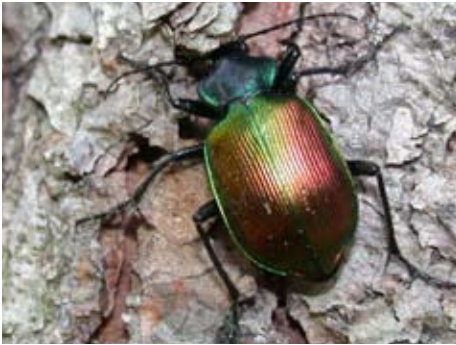
Fig. 4. Ground beetle adult. 5

The ground beetles are a large group of predatory insects in the family Carabidae. Adults and larvae are considered beneficial and will eat almost any type of insect, including: caterpillars, root maggots, snails and other soil dwelling insects. There are more than 3,000 different kinds of ground beetles in North America and they range from 6-30 mm in length. Many will have a solid, shiny black body with hardened and ridged forewings (Figs. 4-6). Some ground beetles have a black body and iridescent red, purple or green markings on the forewings. Most ground beetles have a relatively long body, flattened head, threadlike antennae, and long legs. Sometimes adults can have enlarged mandibles for grasping prey. As the name suggests, adults prefer to run on the ground and rarely fly. In general, adults are actively hunting on the ground at night and hide under rocks or debris during the day.