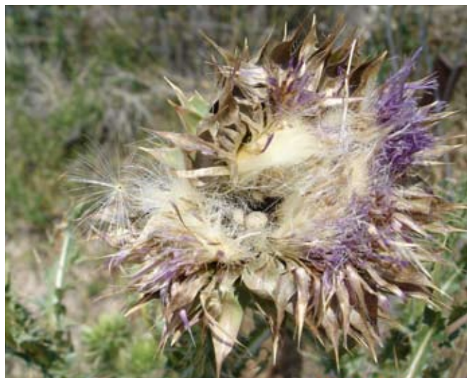
Fig. 1. Musk thistle is readily eaten by beneficial insects like thistle-head weevil larvae. 1

There are many beneficial beetles in Utah besides lady beetles or ladybugs. Beetles can significantly reduce common insect and weed problems and in some cases eliminate the need for chemical control. Examples of beneficial beetles include: ground beetles, rove beetles, tiger beetles and tortoise beetles. Many of these beetles are native to Utah, while others have been purposely introduced to help control damage from exotic insect and weed pests (Figs. 1, 2). As with most beneficial insects, there can be negative side effects or consequences associated with too many insects in a given area. But in general, beneficial beetles suppress persistent insect problems.