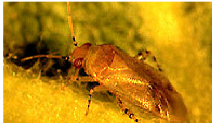
The adult is a beneficial predator of aphids, mites, and pear psylla.