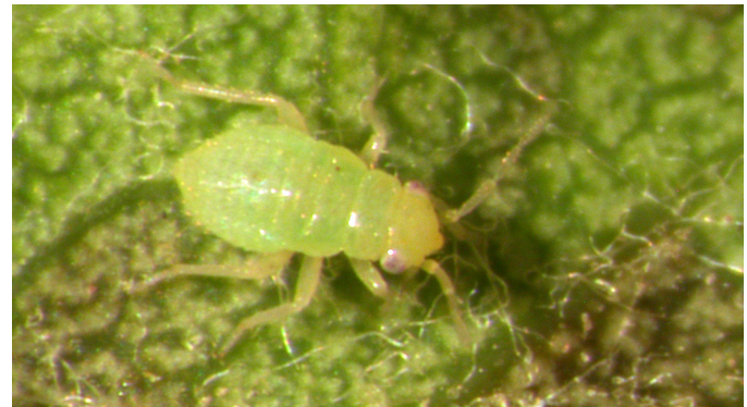
Young nymphs cause injury to apples when they feed on blossom calyxes and developing fruit.