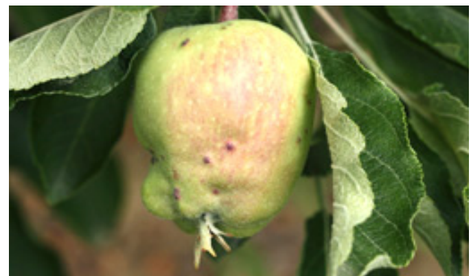
Early season feeding on apple fruits by nymphs results in corky bumps and sometimes fruit distortion (E. Beers, Washington State University).

The campylomma bug (or mullein plant bug; Hemiptera: Miridae) causes sporadic damage in Utah apple orchards. Damage is inflicted by nymphs, which feed on developing fruit causing dimpling and fruit distortion. As apple fruits mature, they become less susceptible to campylomma injury. Injury appears shortly after petal fall as small corky areas alone or small corky areas surrounded by a depression. Golden Delicious is typically more susceptible to damage than Red Delicious. Pear fruit rarely suffer damage, even at high campylomma populations. Campylomma overwinter as eggs laid in the young twigs of apple, pear and other rosaceous plants. These eggs begin hatching in the spring at about pink stage of apple bud development. This insect has three to four generations per year. A portion of first generation adults migrate from orchard trees to herbaceous weeds, particularly common mullein. However, campylomma can be found in apple and pear orchards throughout the growing season. Late nymphal stages and adults are beneficial predators of aphids, mites and pear psylla. In late summer through fall, adults will migrate into orchards to lay overwintering eggs.