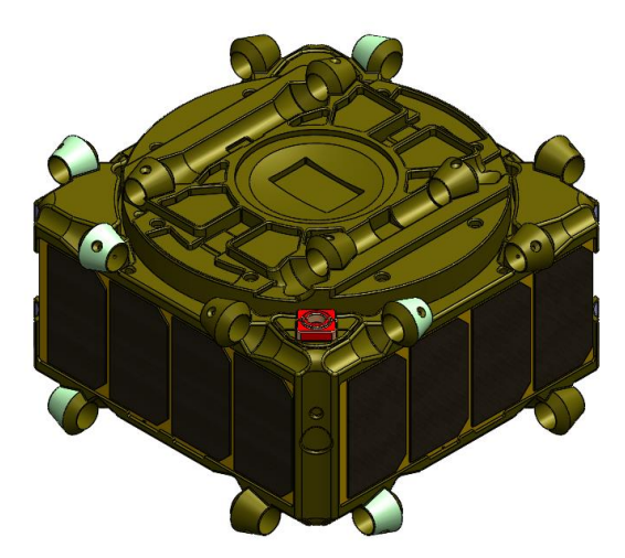
Exhibit 1: System satellite example – HISat (Hyper-Integrated Satlet)